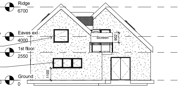
2 Rear 1 : 100