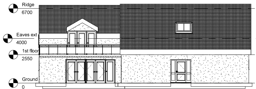
4 side 1 : 100