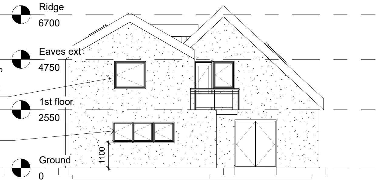
2 Rear 1 : 100