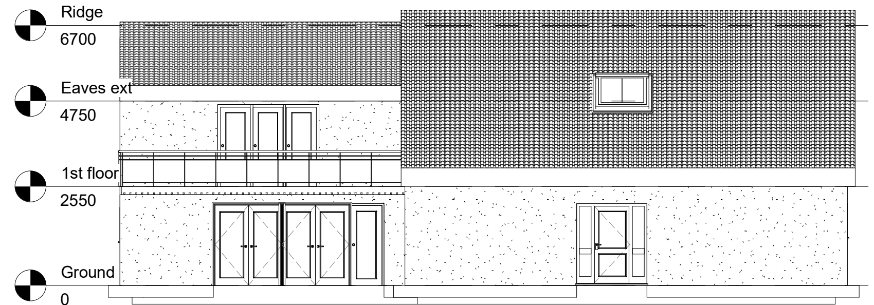
4 side 1 : 100