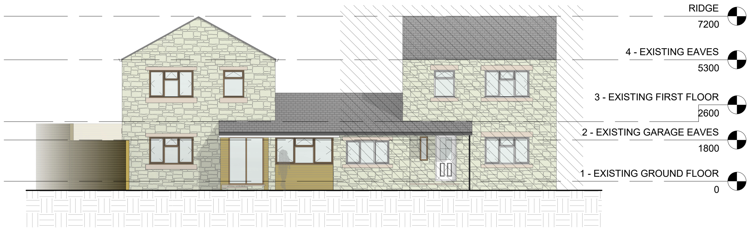
3 EXISTING NORTH WEST 1 : 100