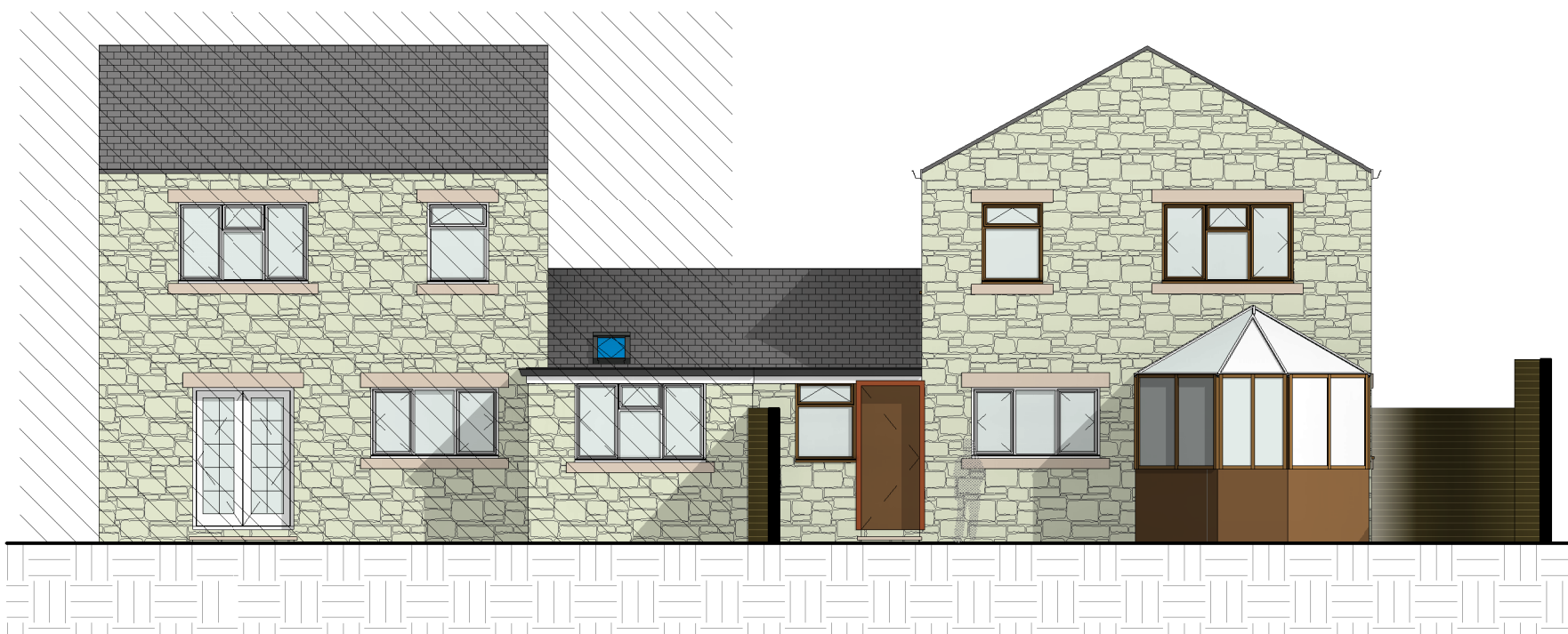
5 EXISTING SOUTH EAST 1 : 100