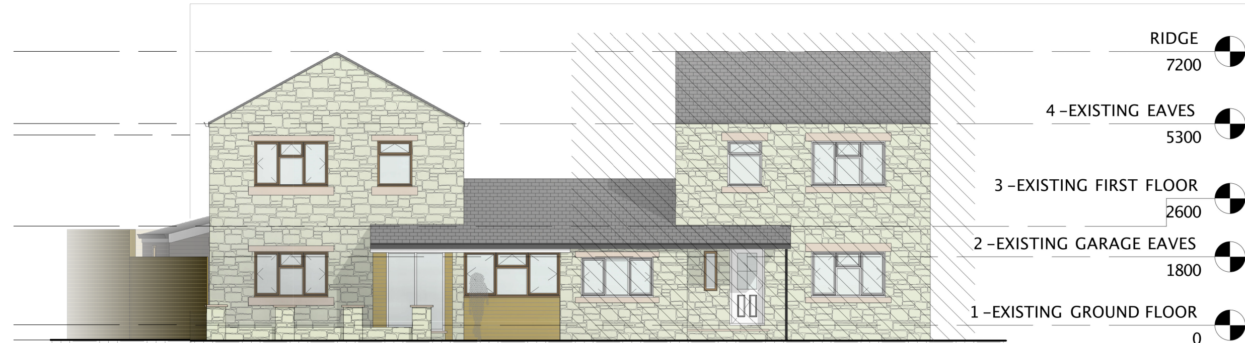
3 PROPOSED NORTHWEST 1 : 100