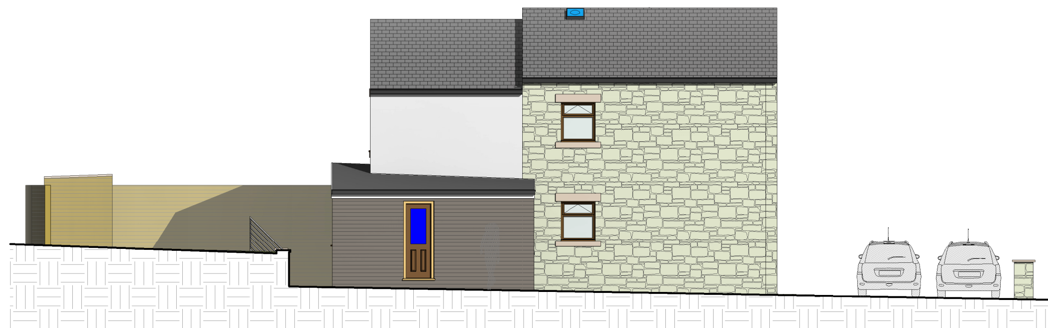
4 PROPOSED NORTHEAST 1 : 100