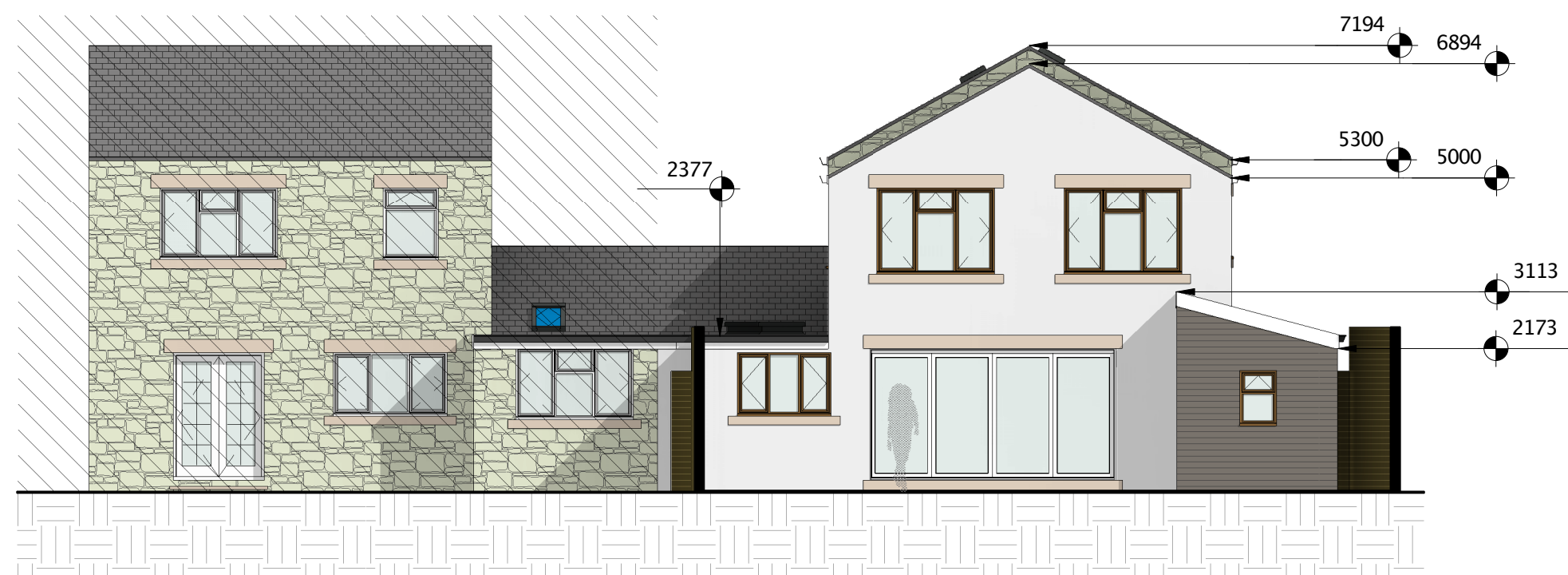
5 PROPOSED SOUTHEAST 1 : 100

PROPOSED REAR EXTENSION TO 8 BACK LANE, RIMMINGTON.