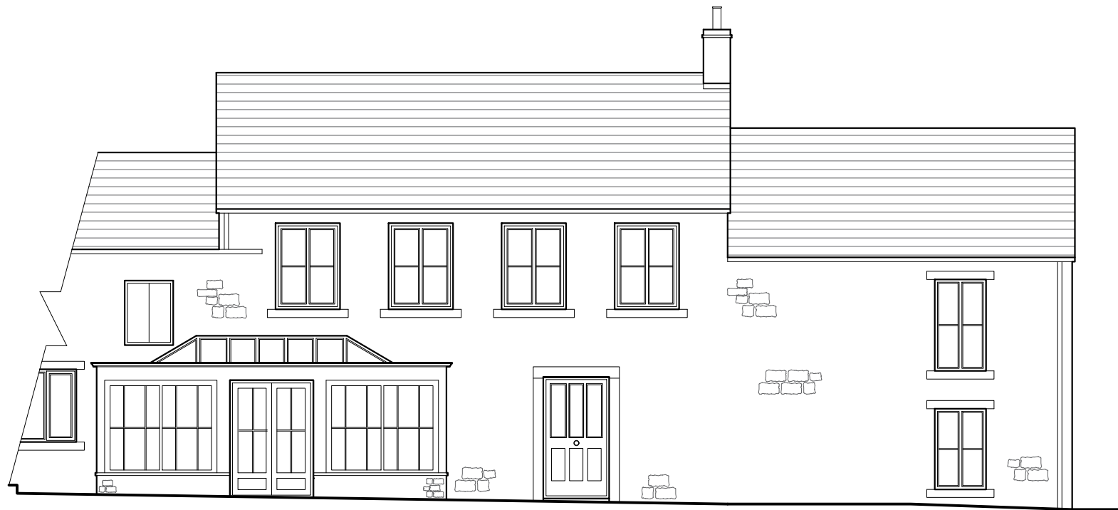
EXISTING WEST FACING ELEVATION SCALE 1:100