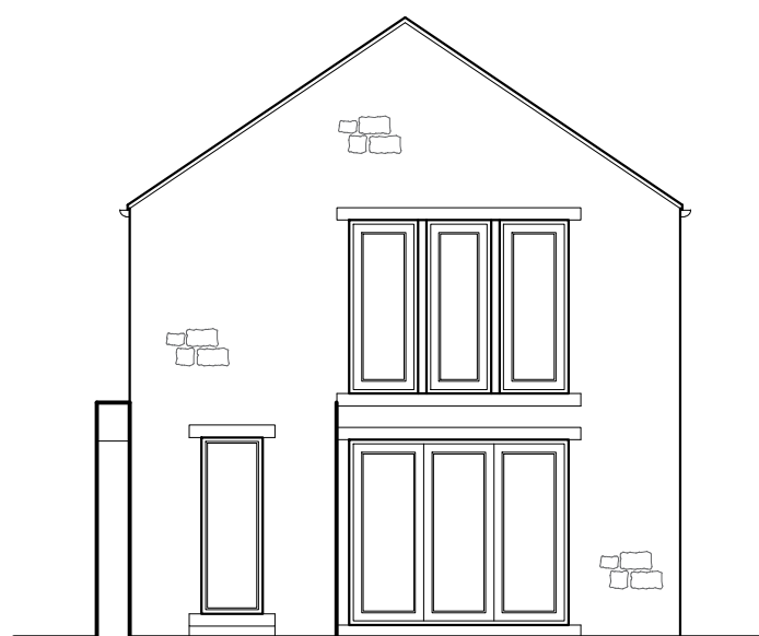
EXISTING SOUTH FACING ELEVATION SCALE 1:100