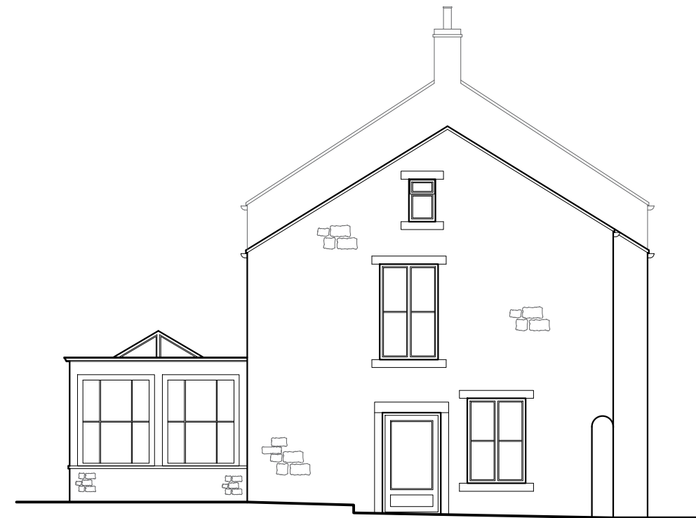
EXISTING SOUTH FACING ELEVATION SCALE 1:100