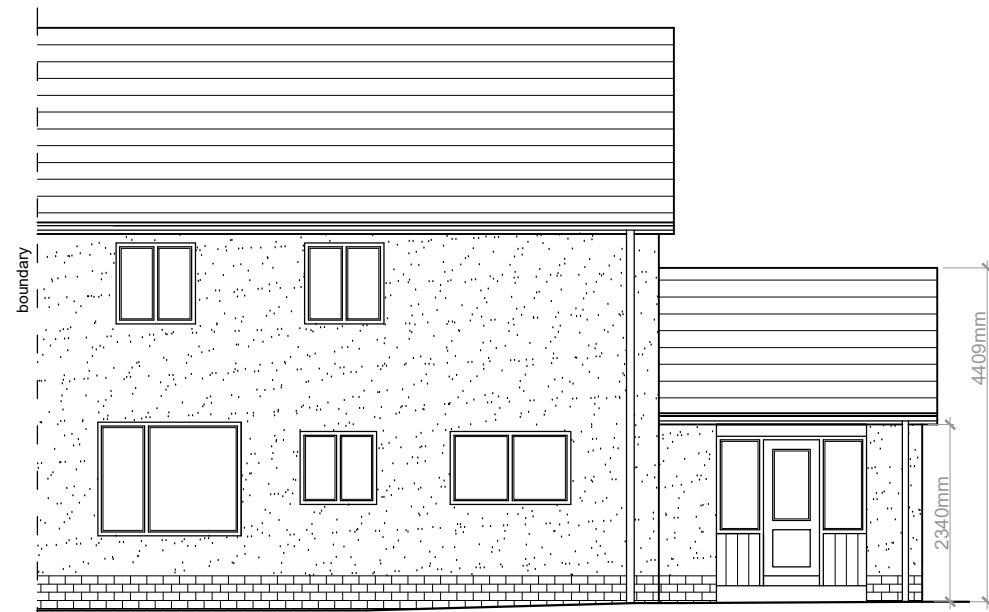
Rear (West) Elevation