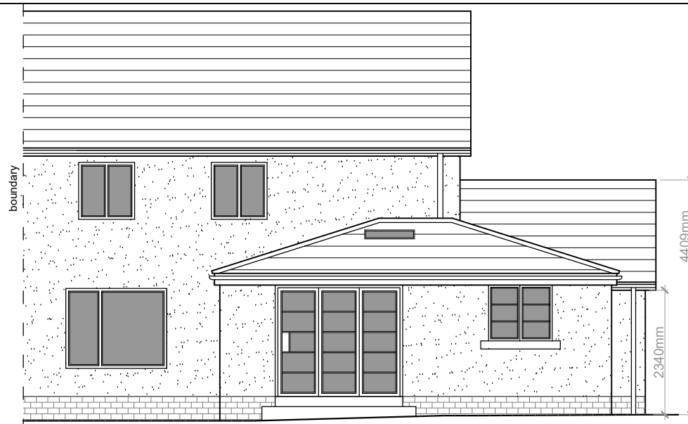
Rear (West) Elevation