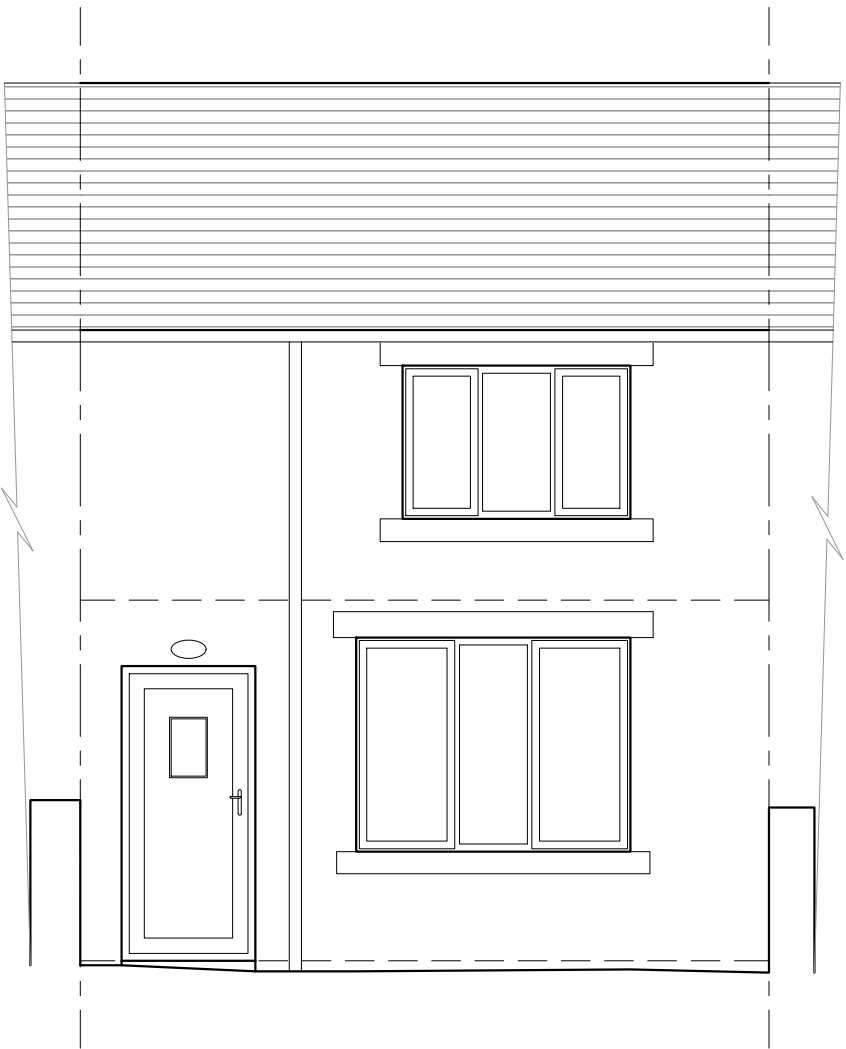
EXISTING NORTH ELEVATION SCALE 1:50