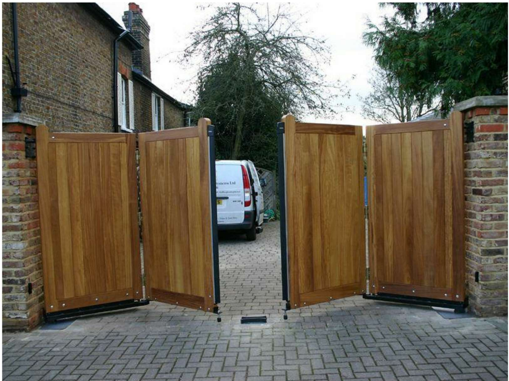
Proposed Gated Entrance to be similar in style to the image gates