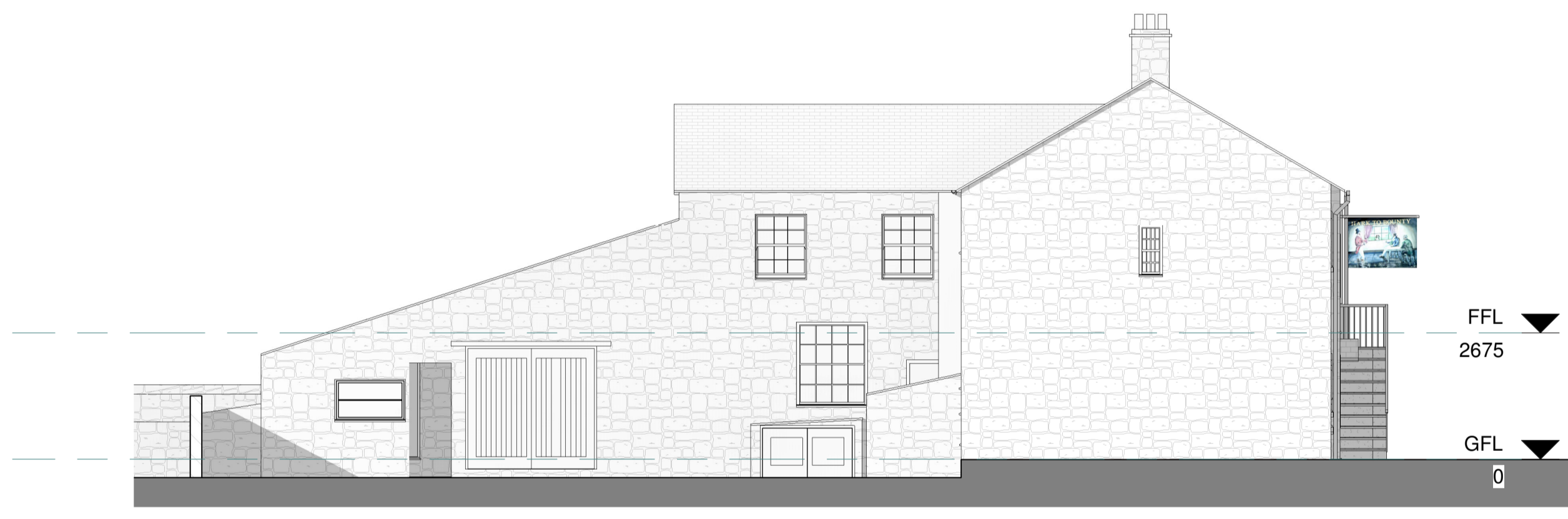
4 09.A1 Proposed Side 2 Elevation 1 : 100