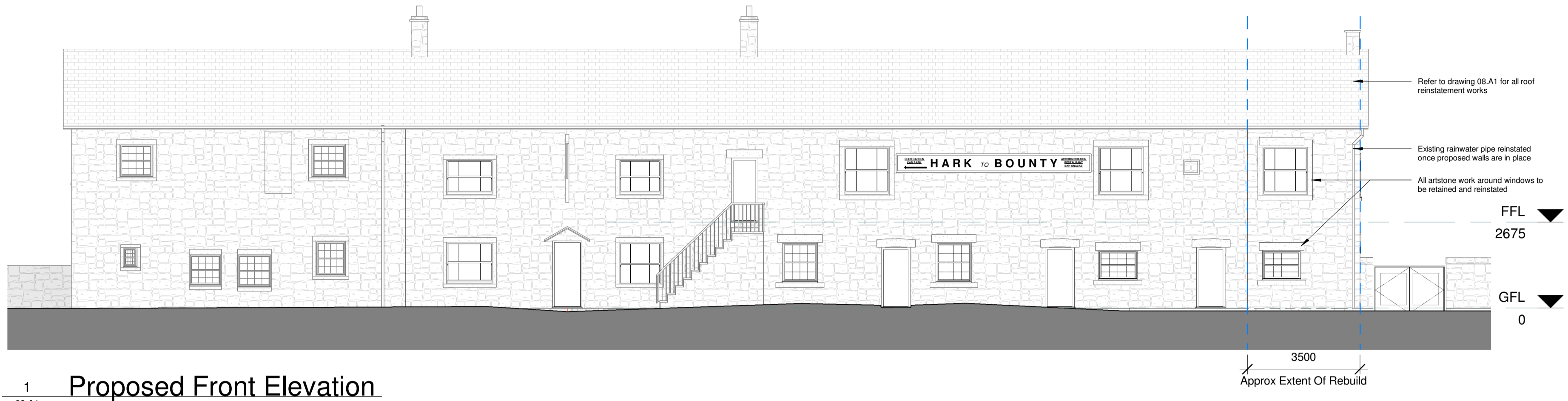
1 09.A1 Proposed Front Elevation 1 : 100