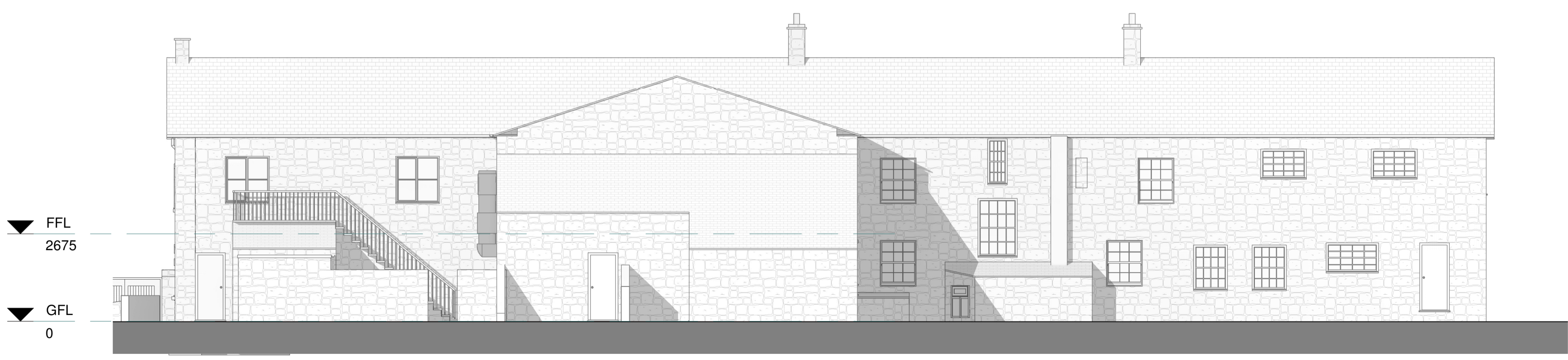
2 09.A1 Proposed Rear Elevation 1 : 100

NOTE: Dimensions need to be checked on site by contractor. Measurements on drawings may differ to site. Contractor must check and confirm all boundary lines on site prior to any works commencing on site.