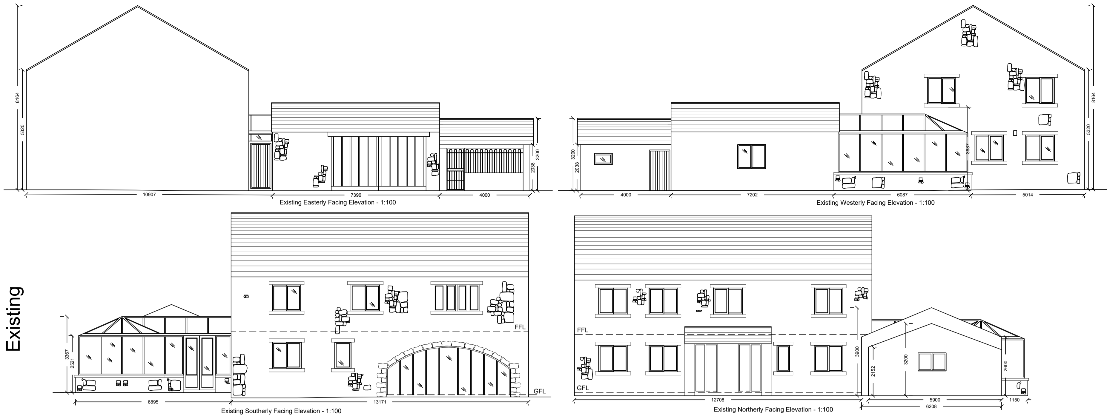
Existing Site Plan - 1:200