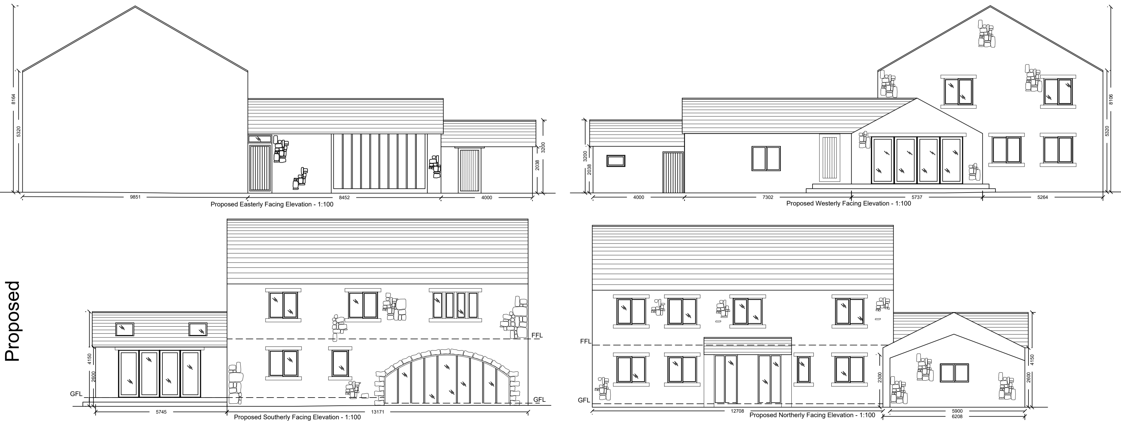
Proposed Site Plan - 1:200