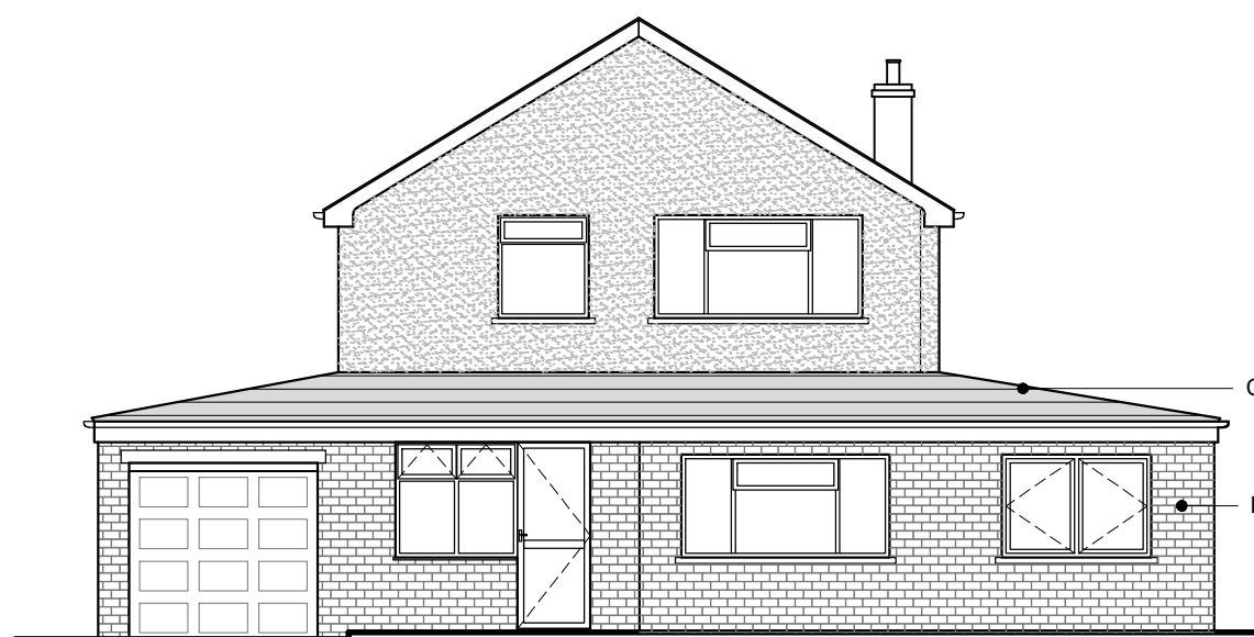
PROPOSED SOUTH WEST ELEVATION Scale 1:100