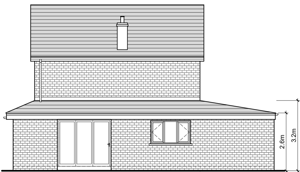
PROPOSED SOUTH EAST ELEVATION Scale 1:100