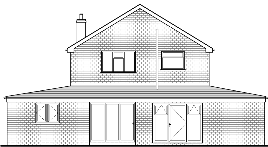
PROPOSED NORTH EAST ELEVATION Scale 1:100