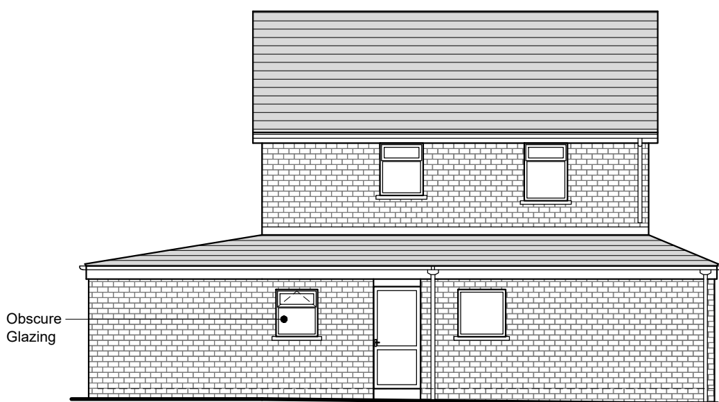
PROPOSED NORTH WEST ELEVATION Scale 1:100