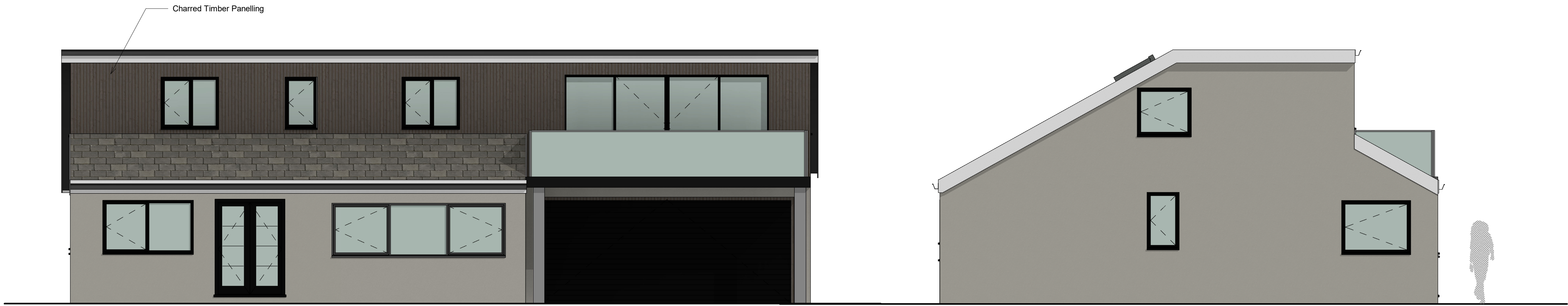
1 PROPOSED NORTH 1 : 50