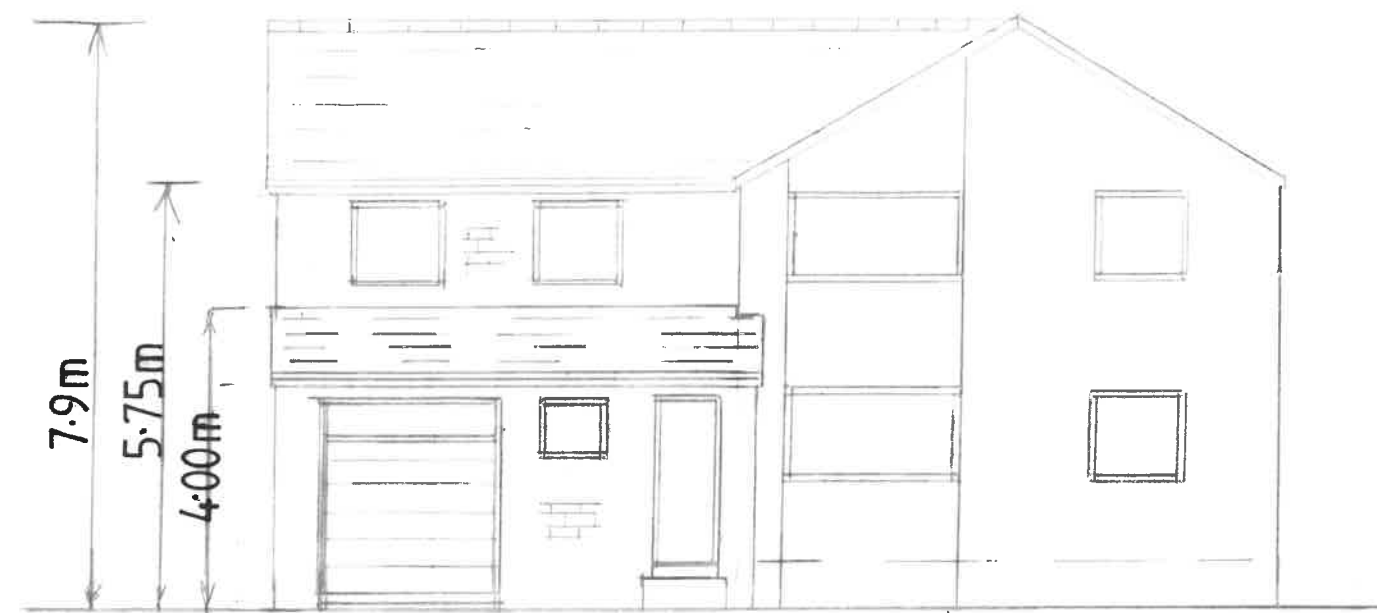
FRONT ELEVATION - PROPOSED