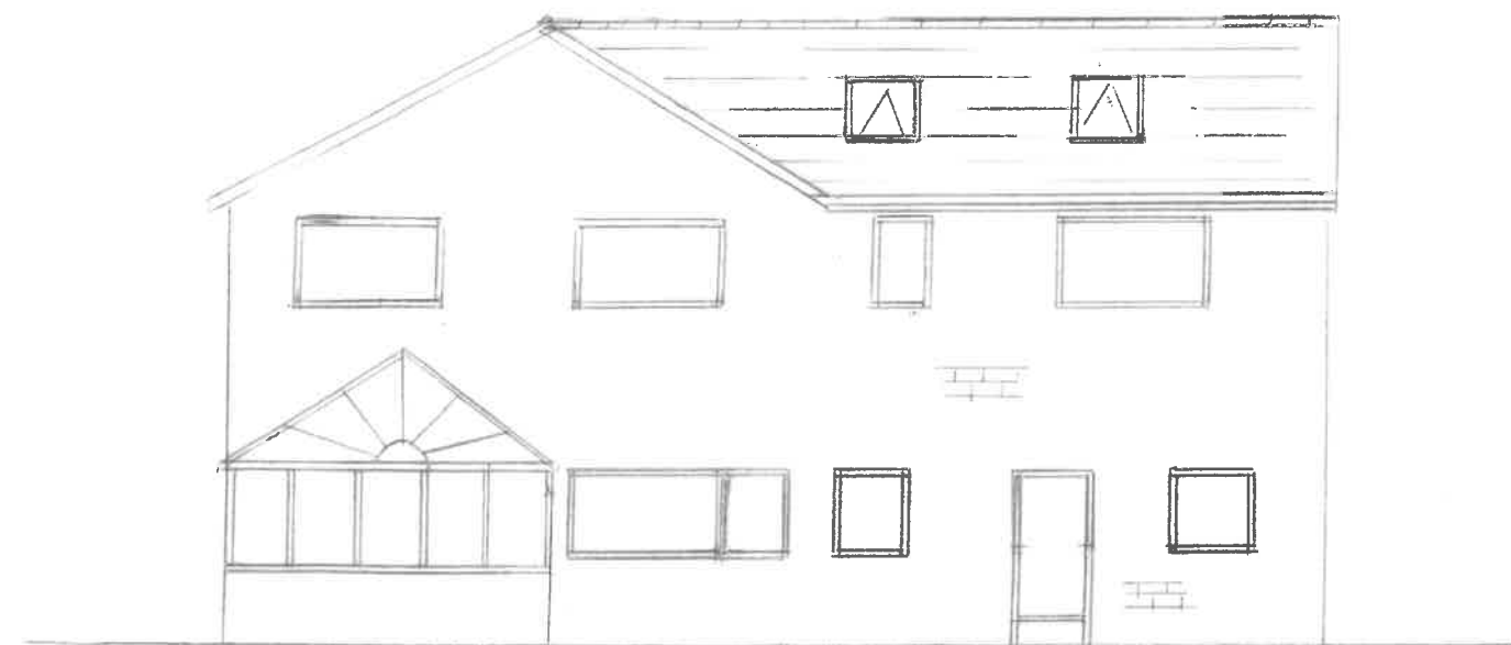
REAR ELEVATION - PROPOSED