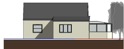
④ Existing North-West Elevation 1:100