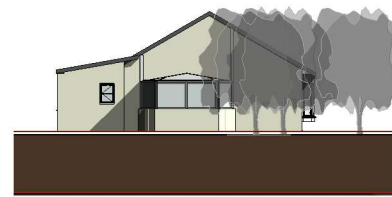
② Existing South-West Elevation 1:100