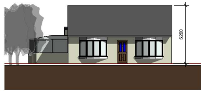
③ Existing South-East Elevation 1:100