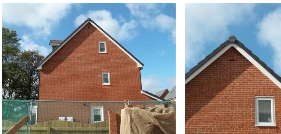
Above: typical unit in situ.