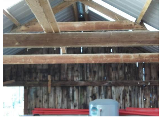
Interior of larger and smaller building

The roof of the larger is of asbestos sheeting, and of the smaller is metal sheeting: