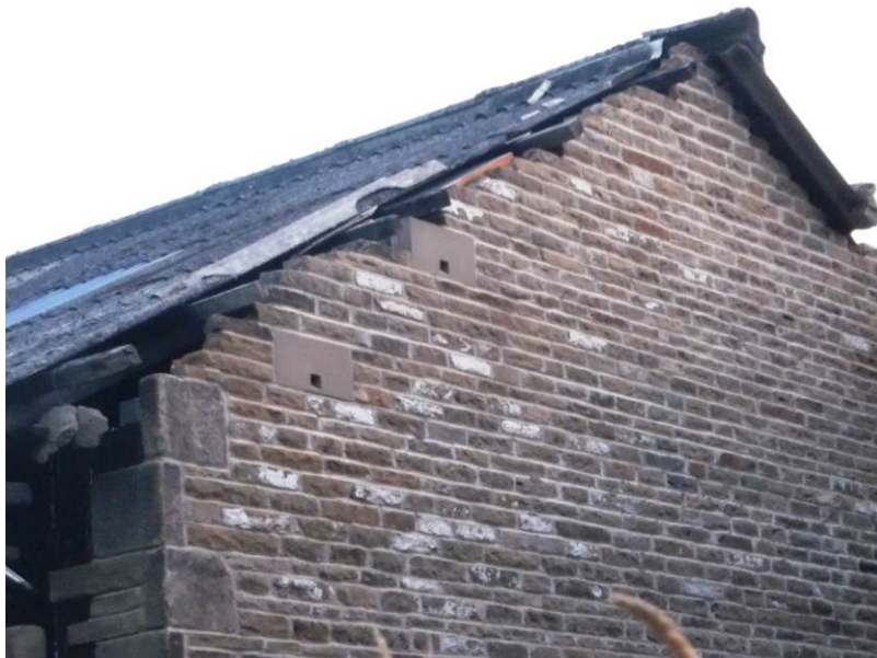
Example of Forticrete boxes in situ