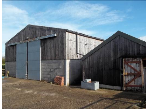
Front of both buildings