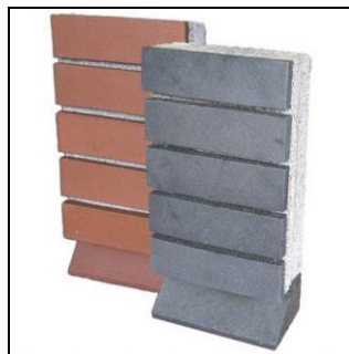
Brick example of Ecosurv Habitat. Can also be faced with stone.

“Designed to be built into an exterior wall and is available in a variety of faces to match the building. Standard facings of red or blue brick - ideal for new builds - are normally available from stock, or boxes can be made to your specific requirements with a face of brick, stone, timber, or plain (for rendering). Supplied unpointed.”