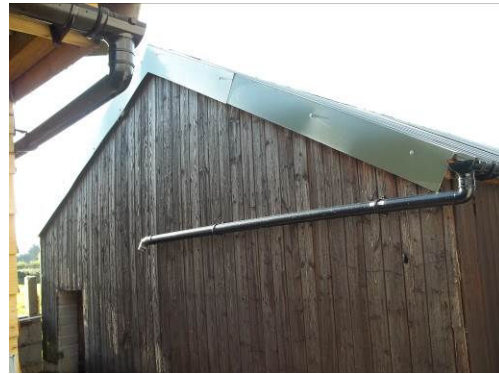
Rear of larger and smaller building

They are in a rural location about 150m from the nearest woodland: