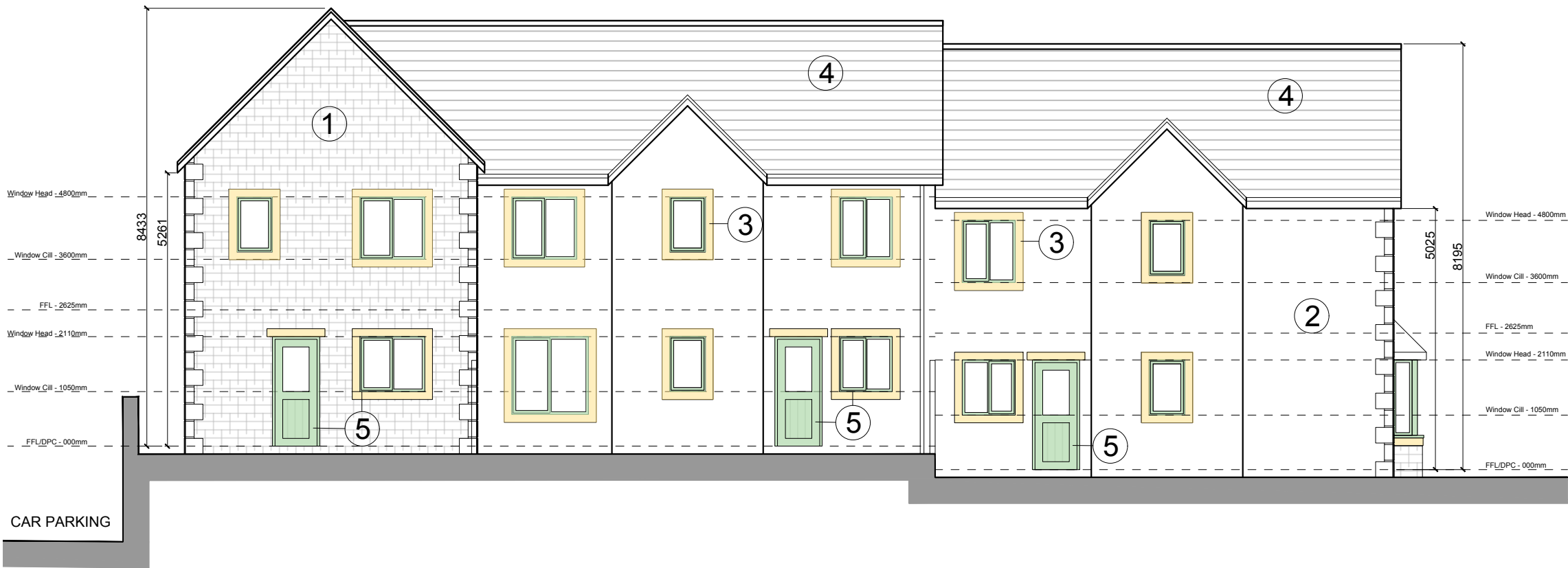
Rear (Bawdlands) Elevation