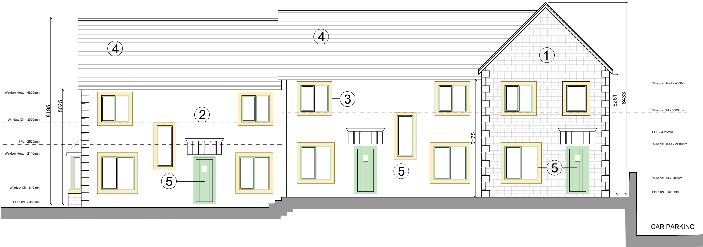
Front (Thorn Street) Elevation