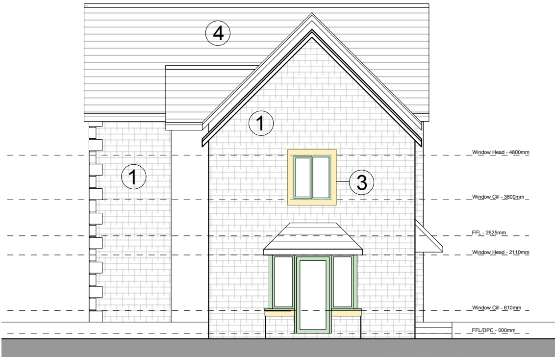
Side (Thorn Street/Bawdlands Junction) Elevation