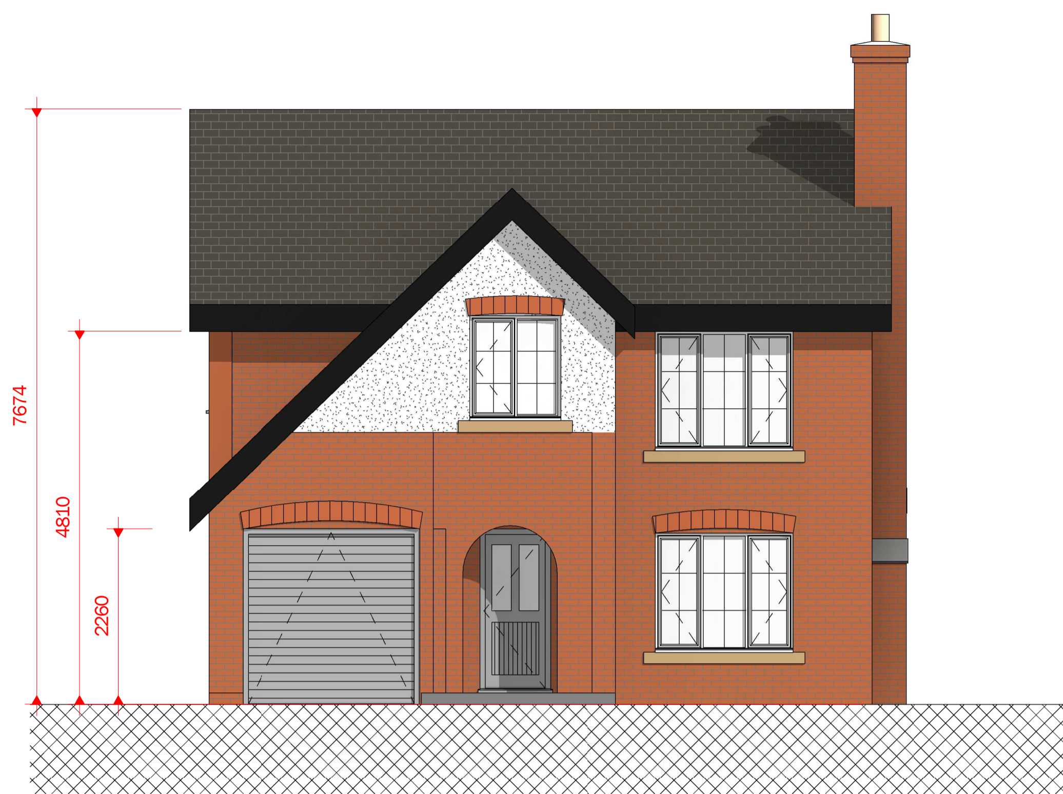
3 EXISTING NORTH WEST 1 : 50