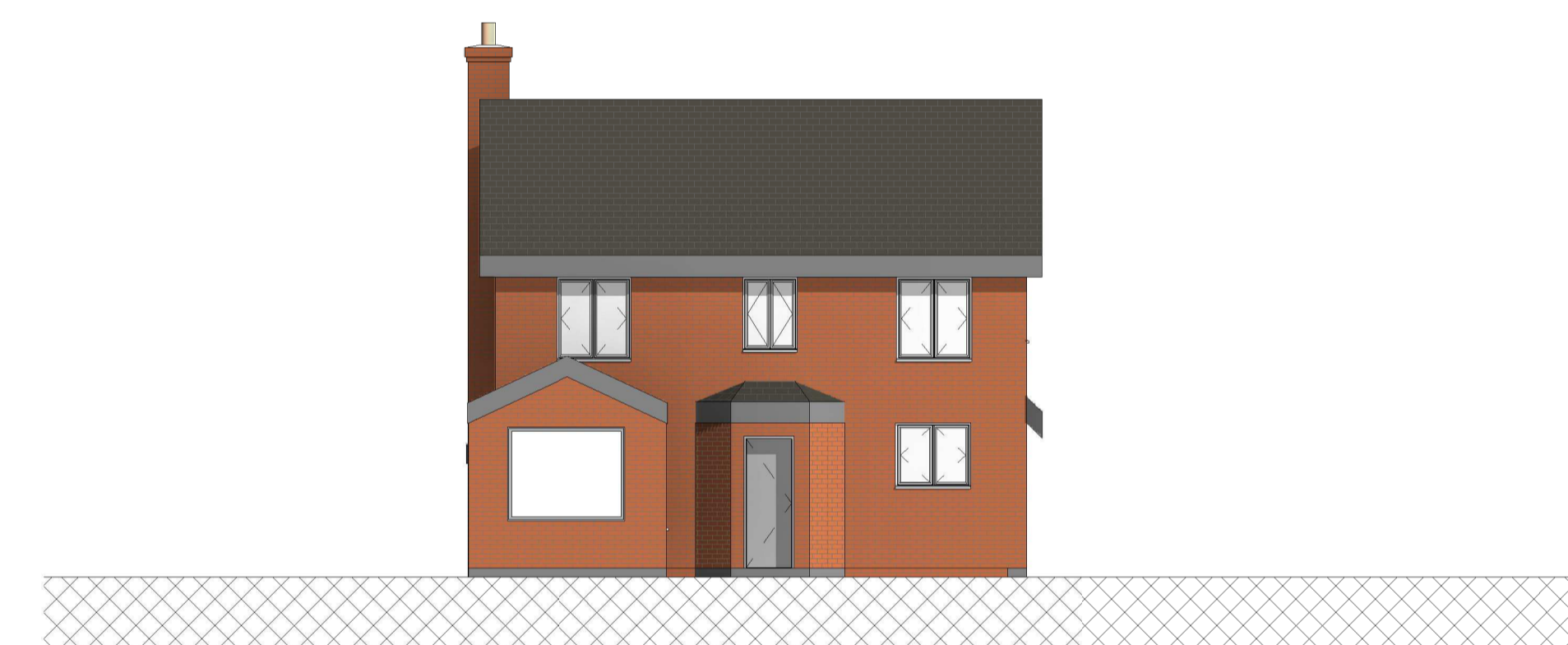
4 EXISTING SOUTH EAST 1 : 100