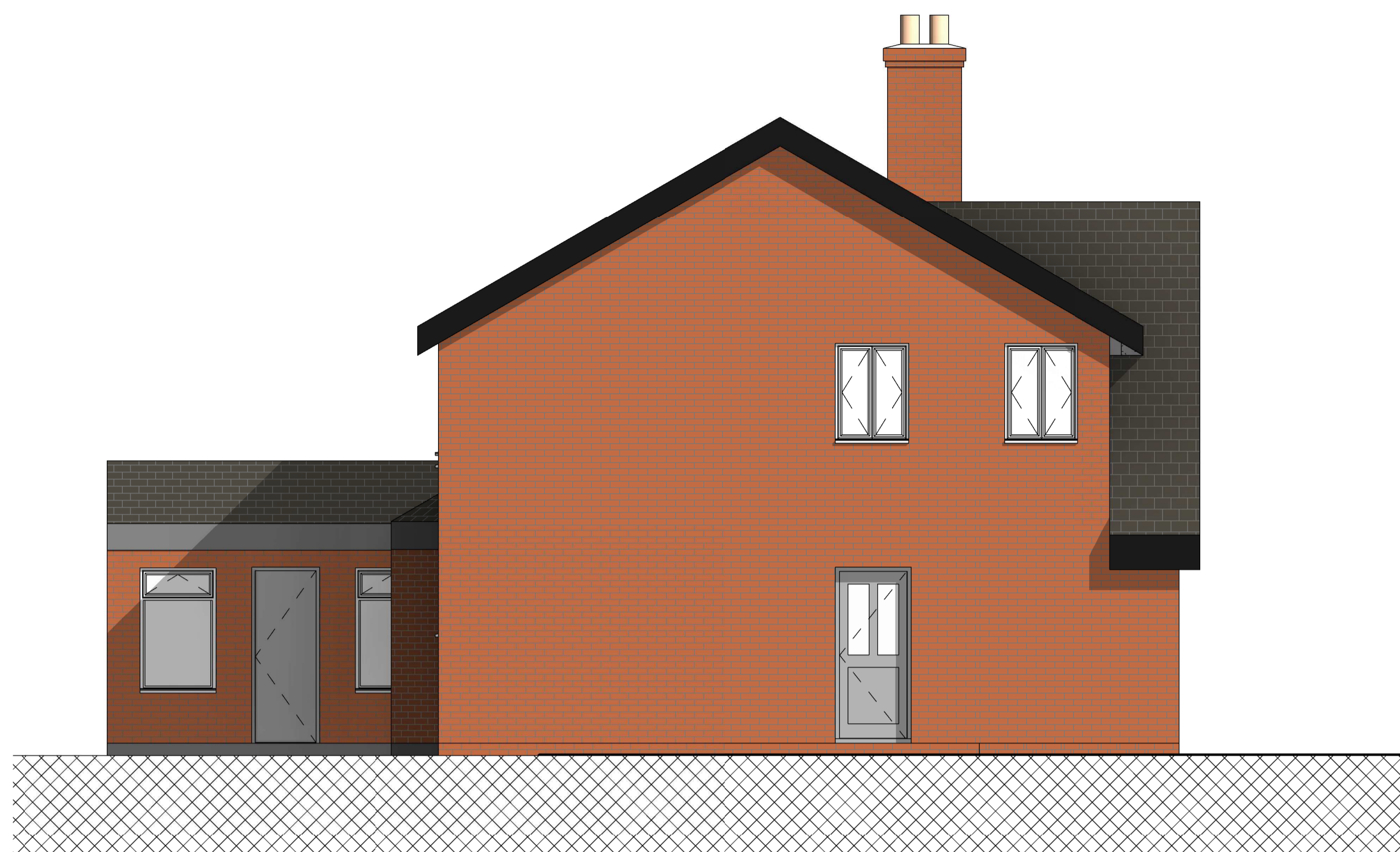
2 EXISTING NORTH EAST 1 : 50