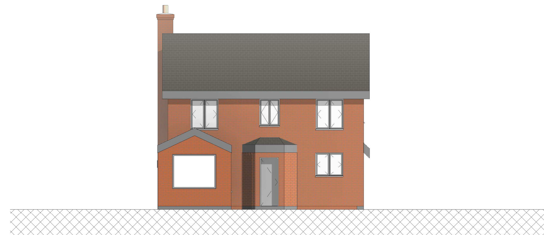
3 PROPOSED SOUTH EAST 1 : 100