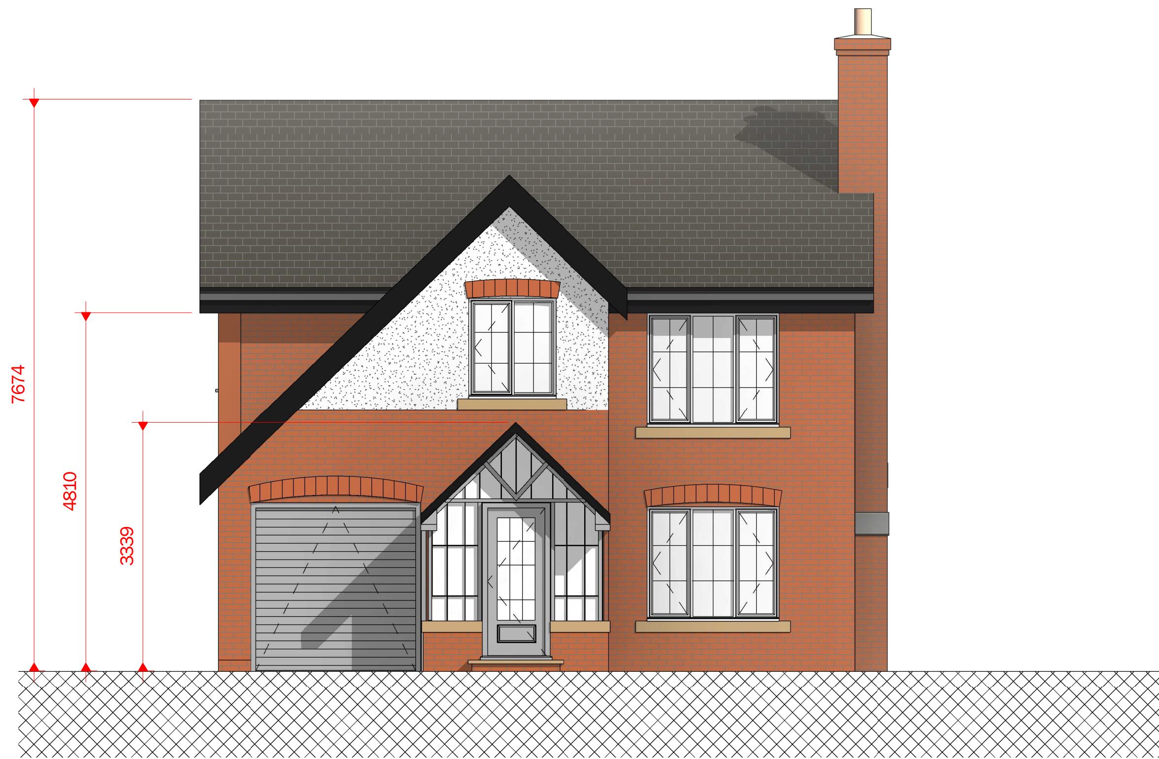
2 PROPOSED NORTH WEST 1 : 50