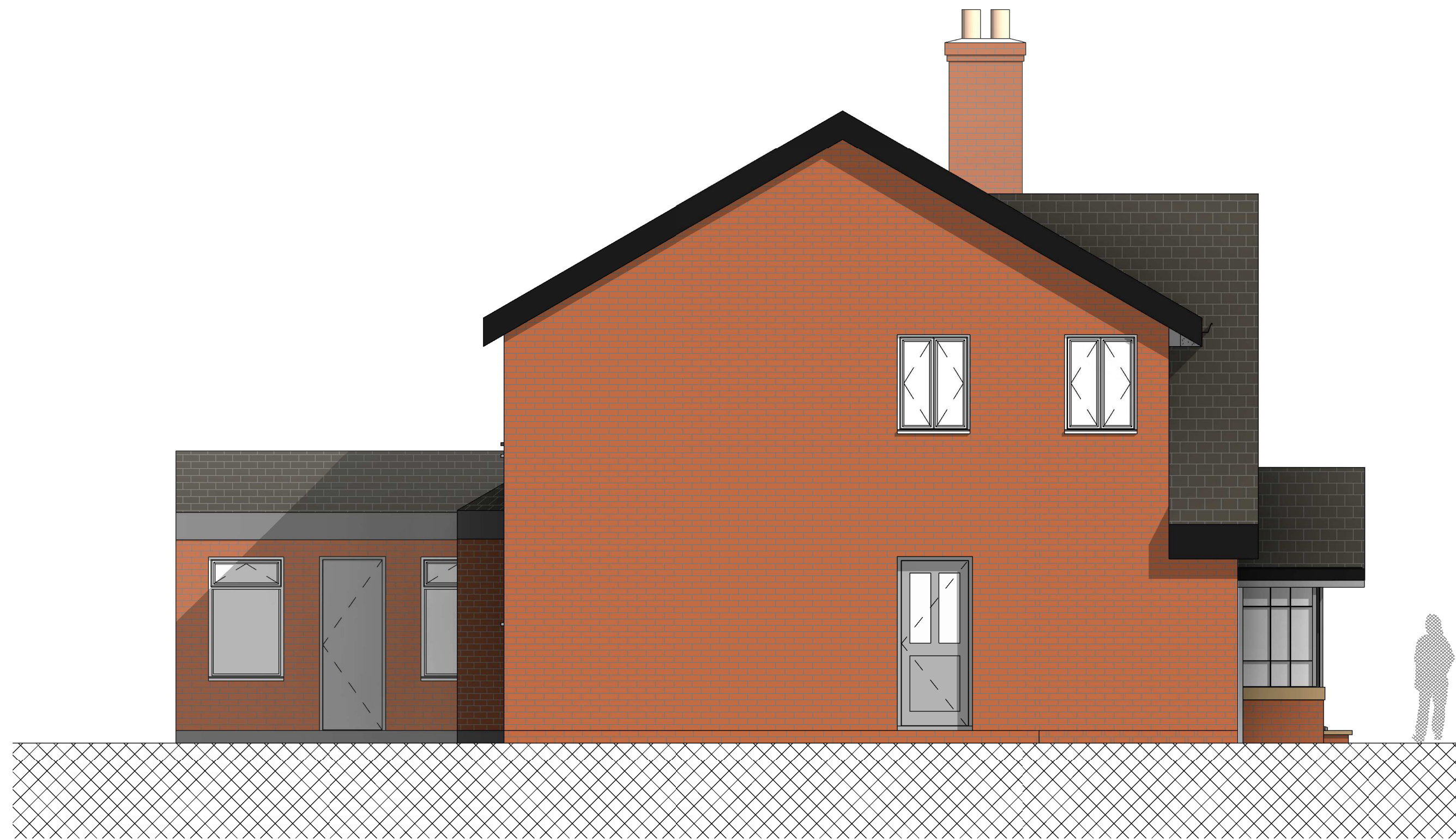
4 PROPOSED NORTH EAST 1 : 50