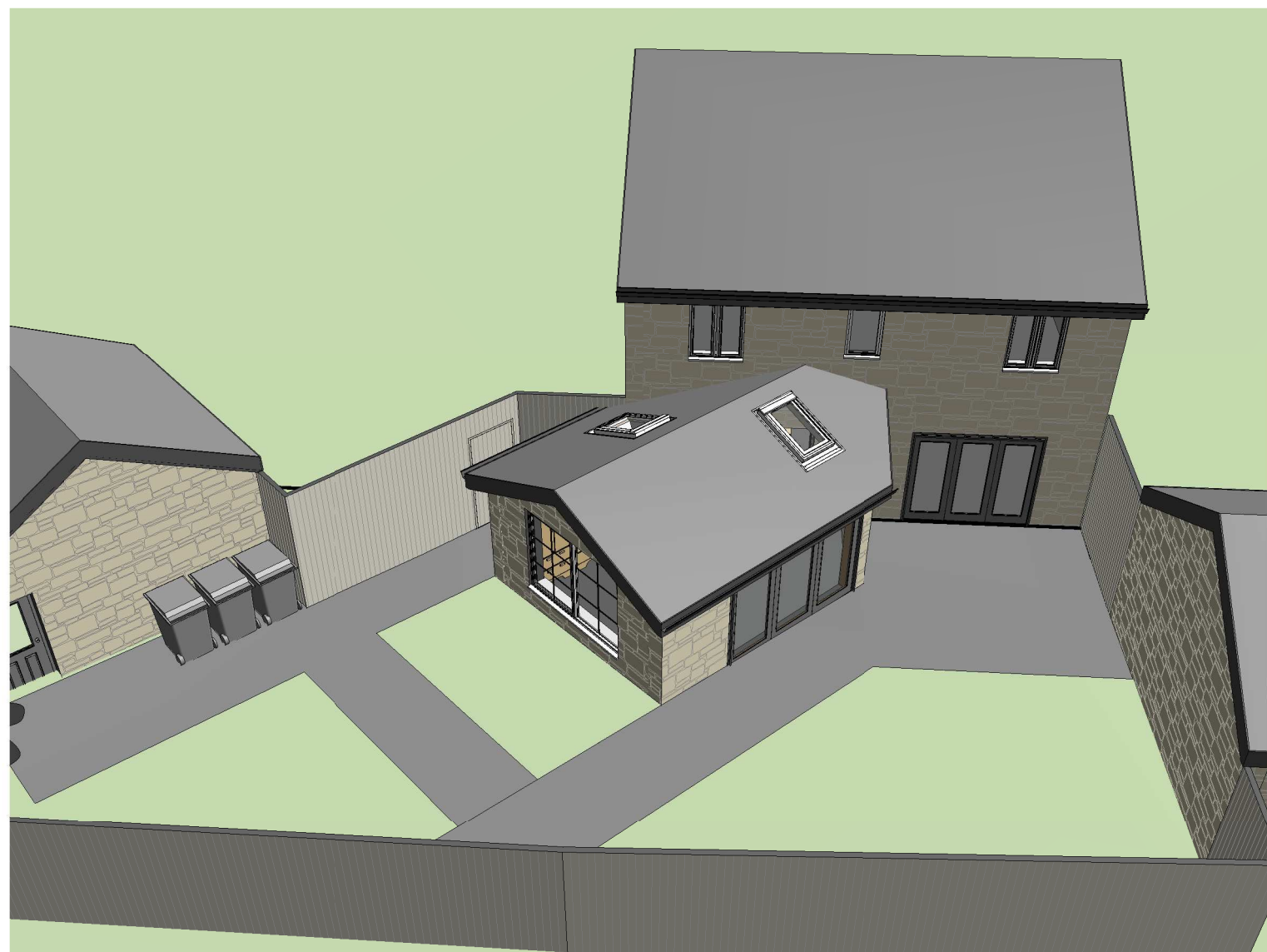
5 AXON VIEW