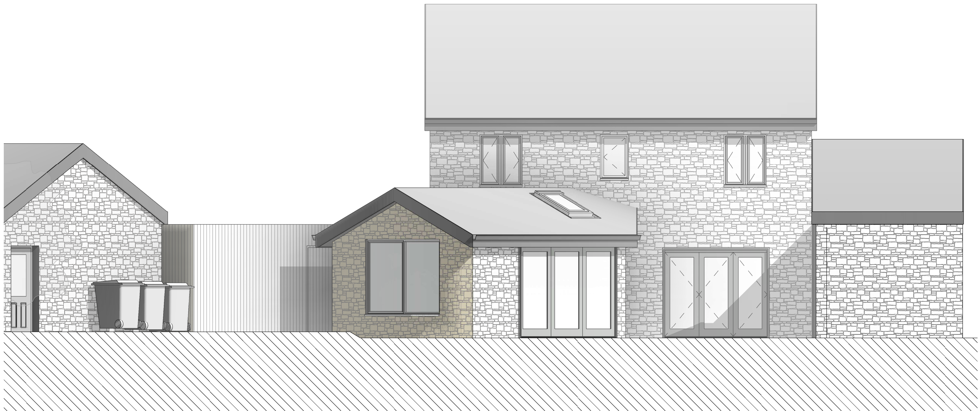
4 PROPOSED NORTH EAST 1 : 50