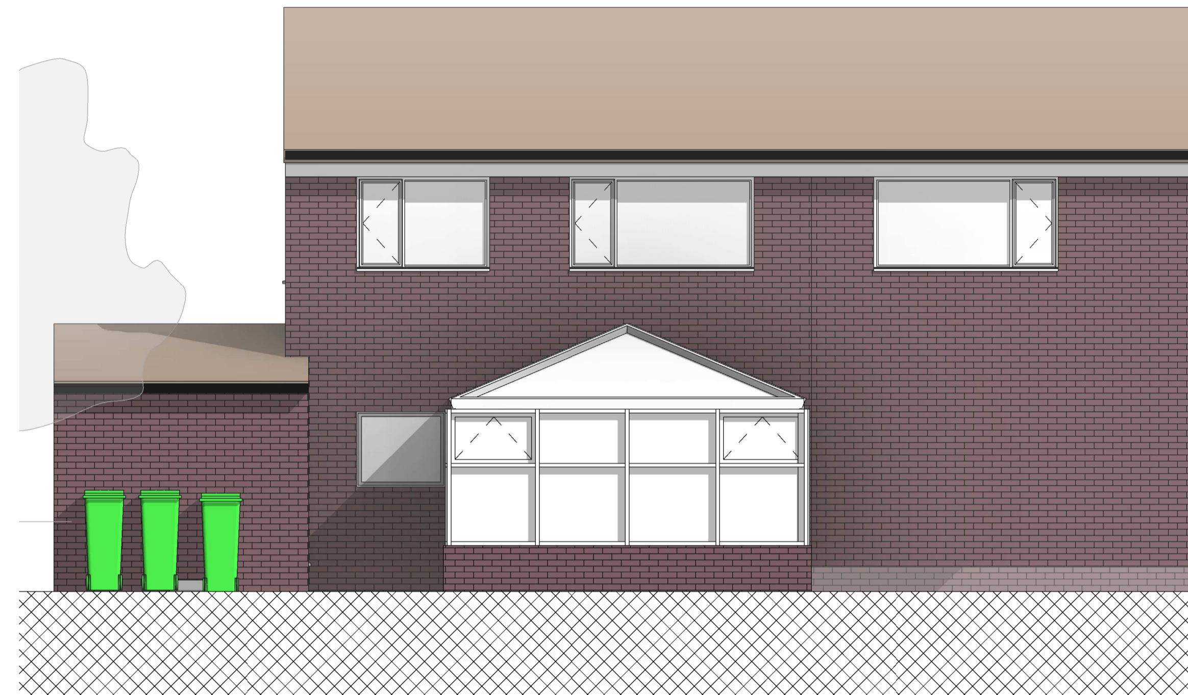
1 PROPOSED NORTH 1 : 50