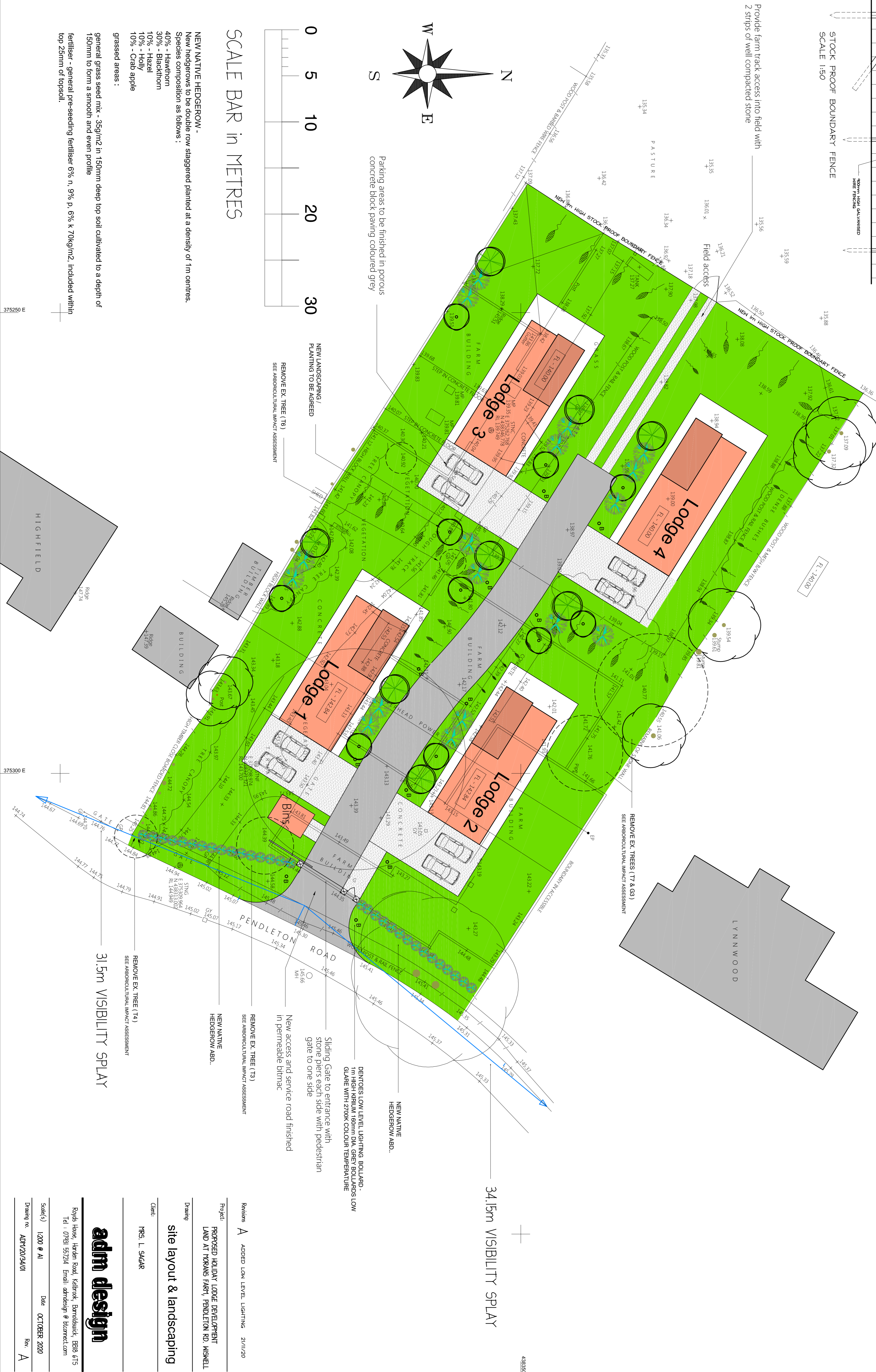
31.5m VISIBILITY SPLAY