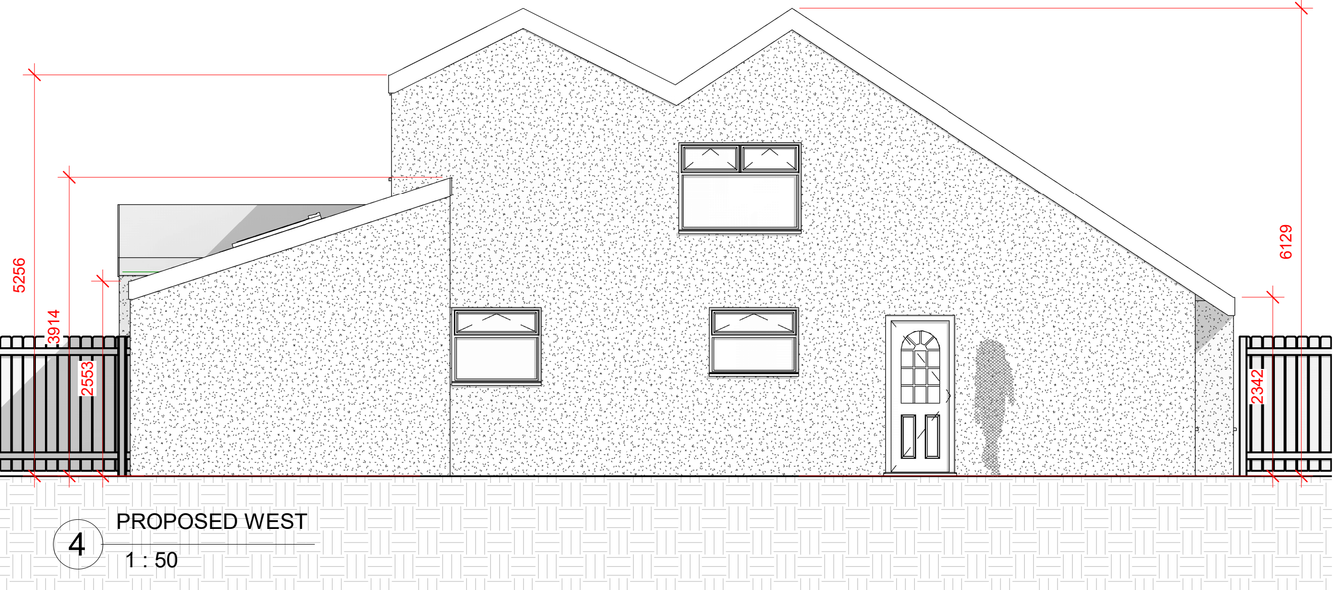
4 PROPOSED WEST 1 : 50