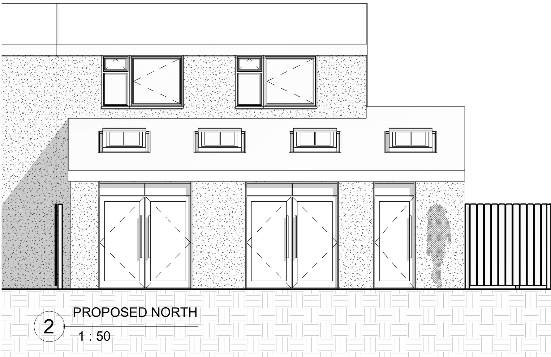
2 PROPOSED NORTH 1 : 50