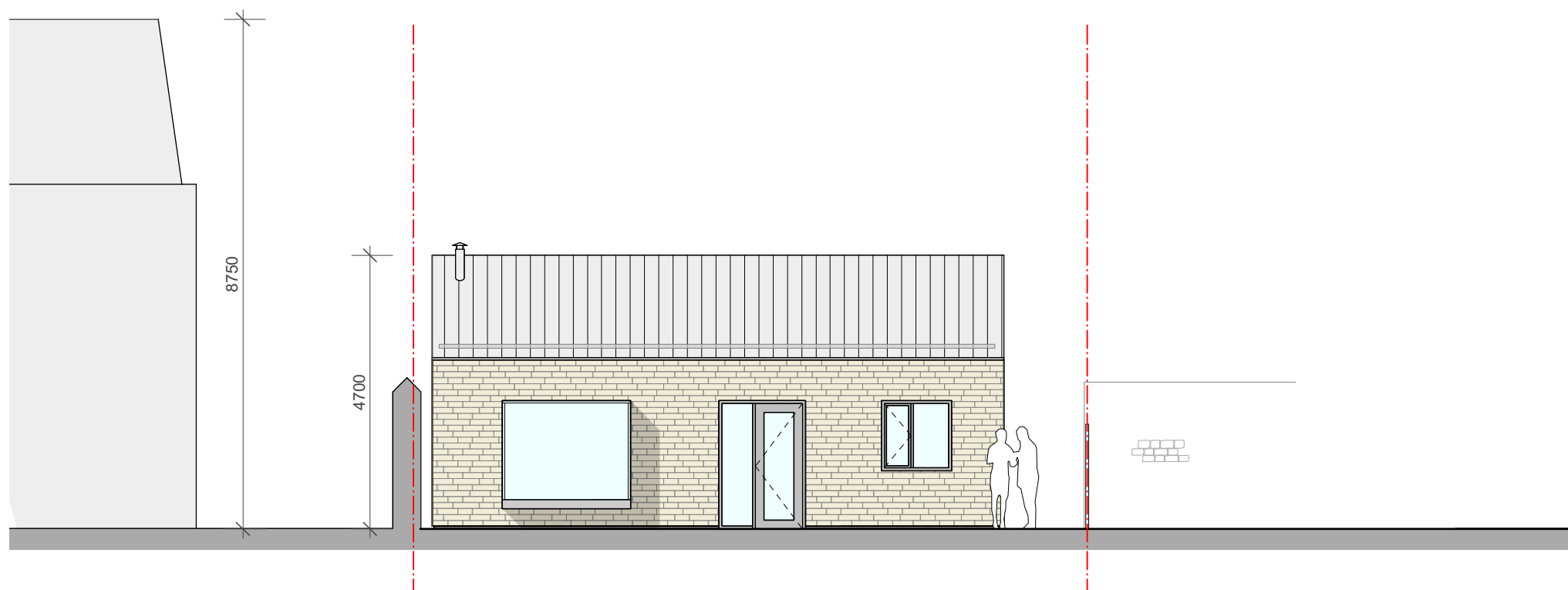
2 PROPOSED NORTH WEST ELEVATION Scale: 1:100