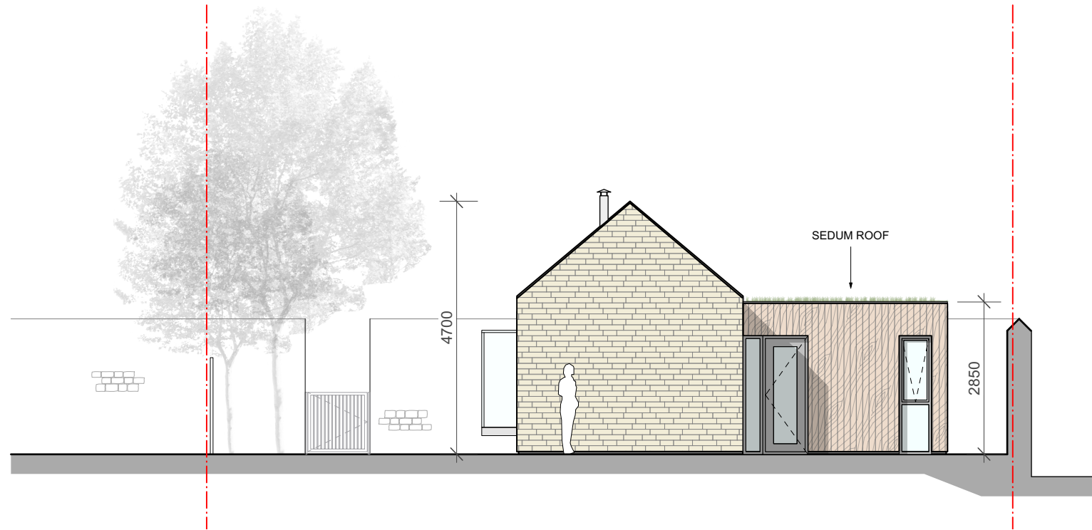
1 PROPOSED SOUTH WEST ELEVATION Scale: 1:100