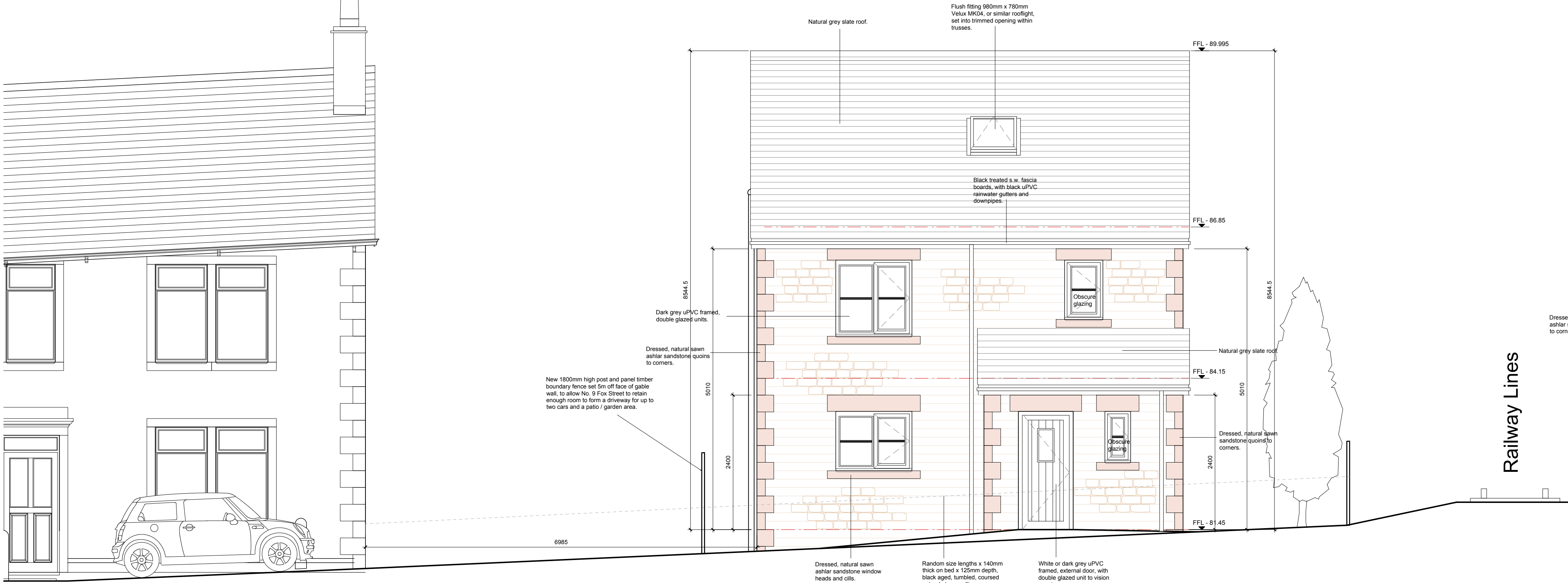
Proposed Front (North) Elevation to Fox Street