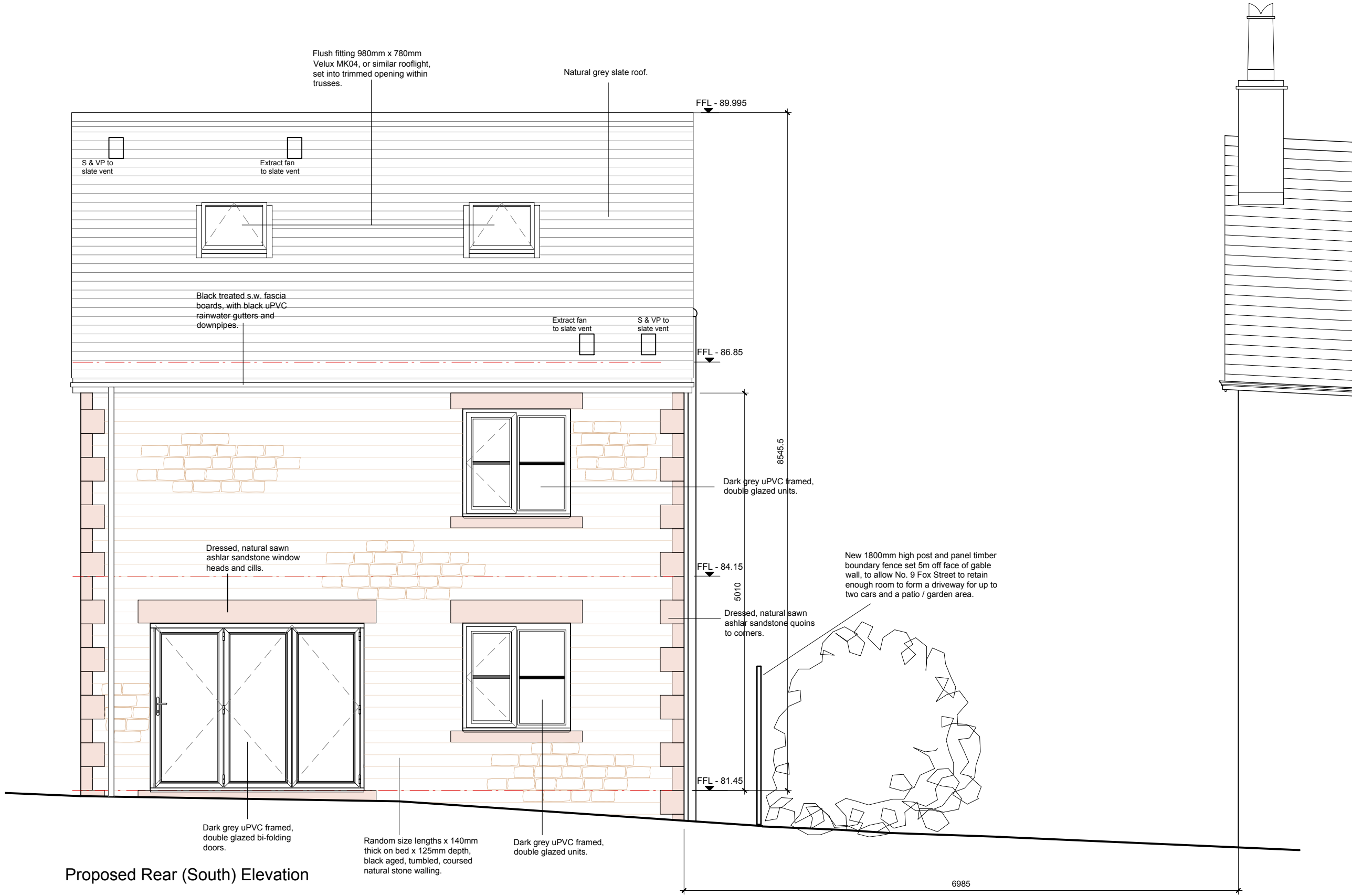
Proposed Rear (South) Elevation