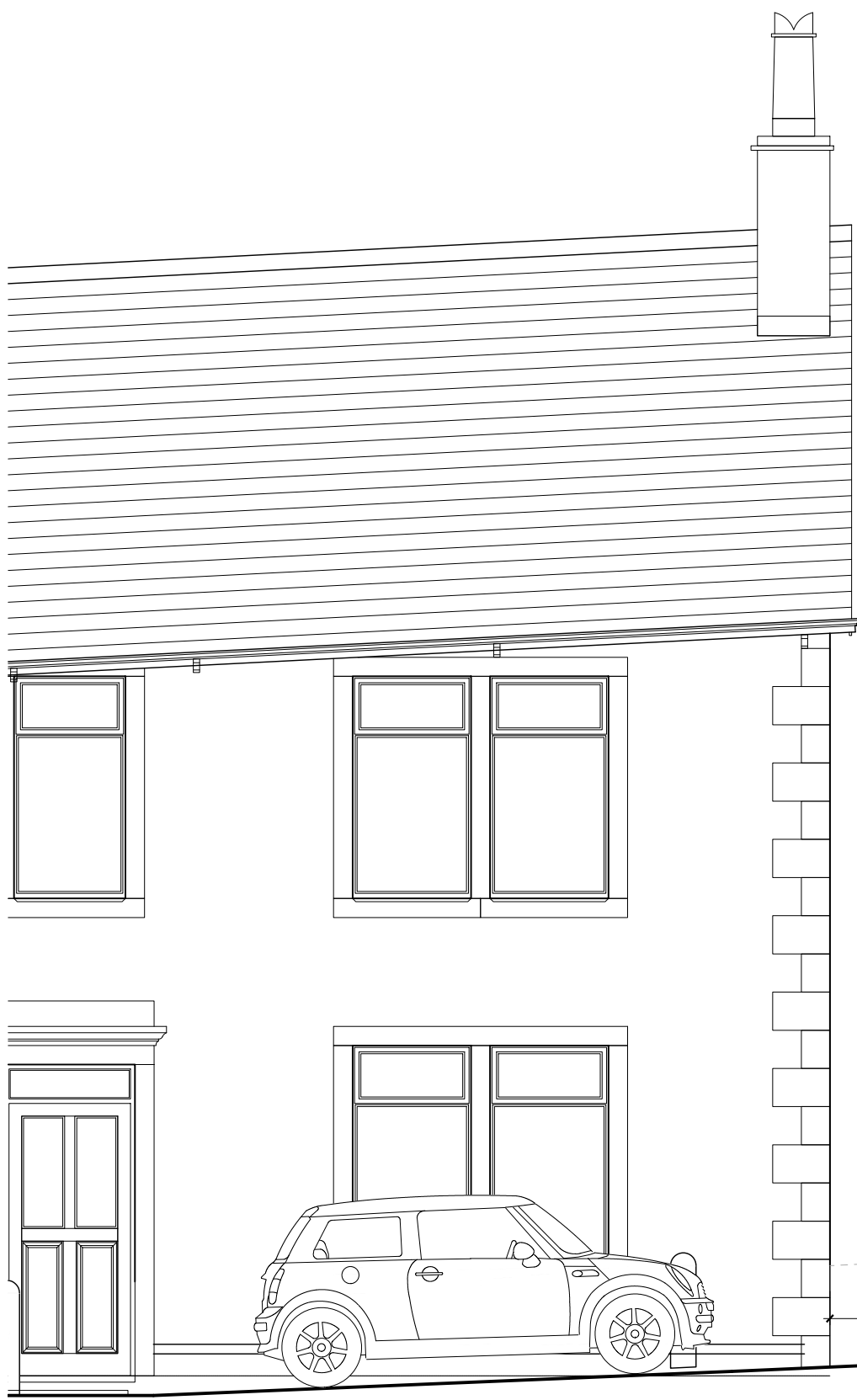
No. 9 Fox Street