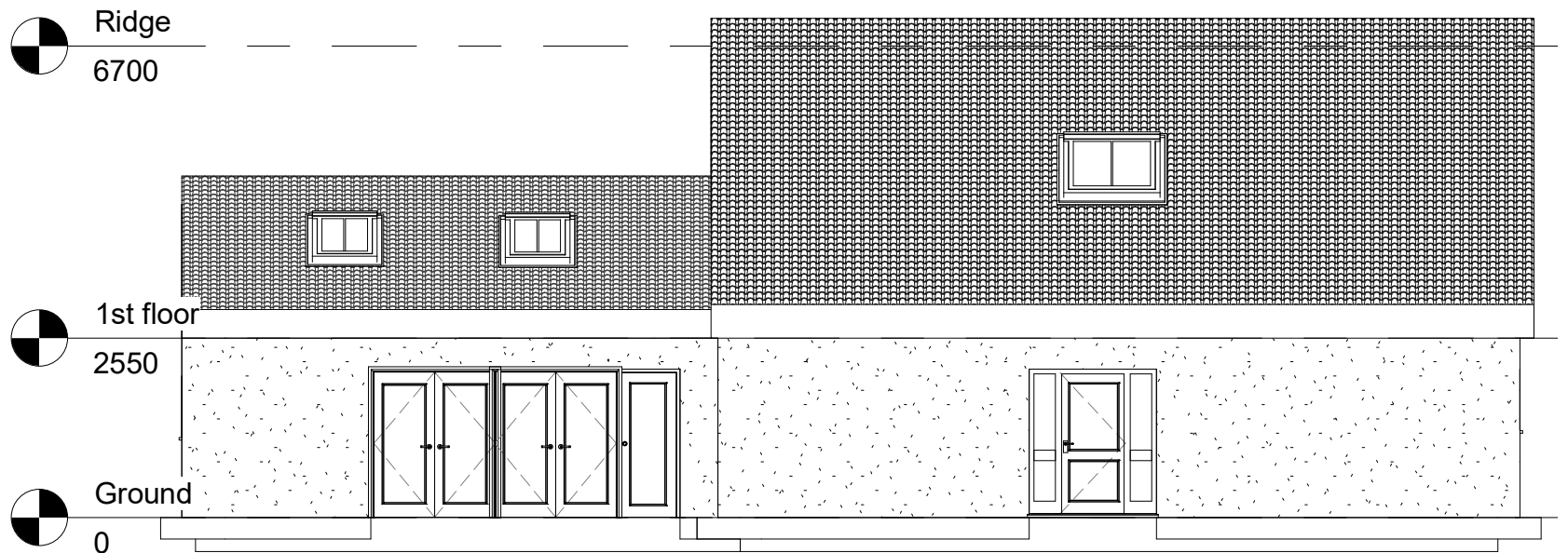
4 side 1 : 100