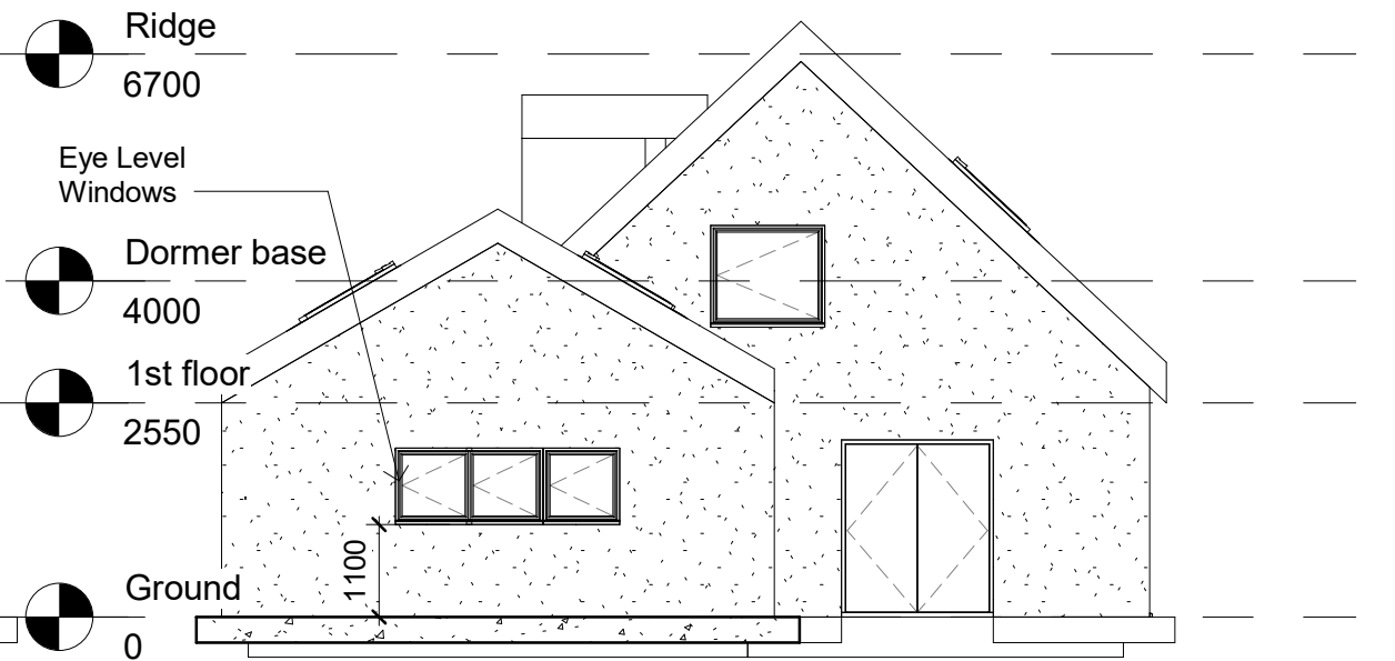
2 Rear 1 : 100