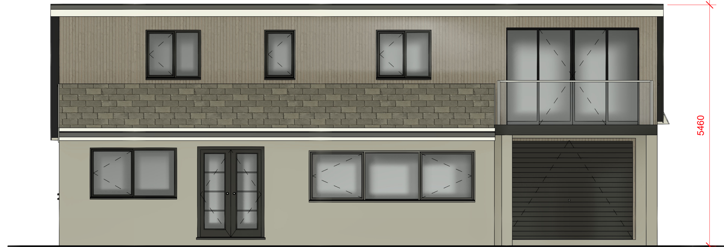
3 Proposed South 1 : 50