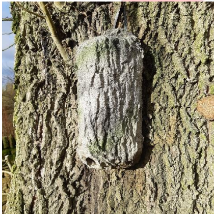
X2 Bat Box

As well as the above we will also incorporate bird and bat boxes in the woodland to the West of the main houses. The boxes we proposed are:-