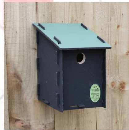
x2 Bird Box