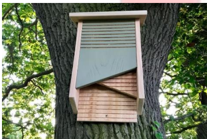
X2 Bat Box