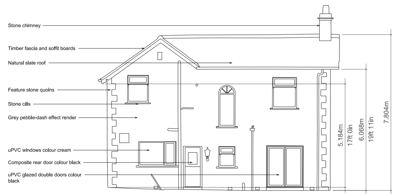
Rear Elevation Scale 1:100