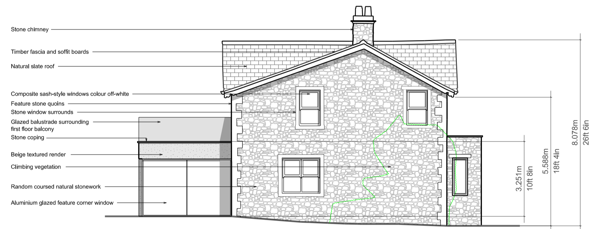
Side Elevation Scale 1:100