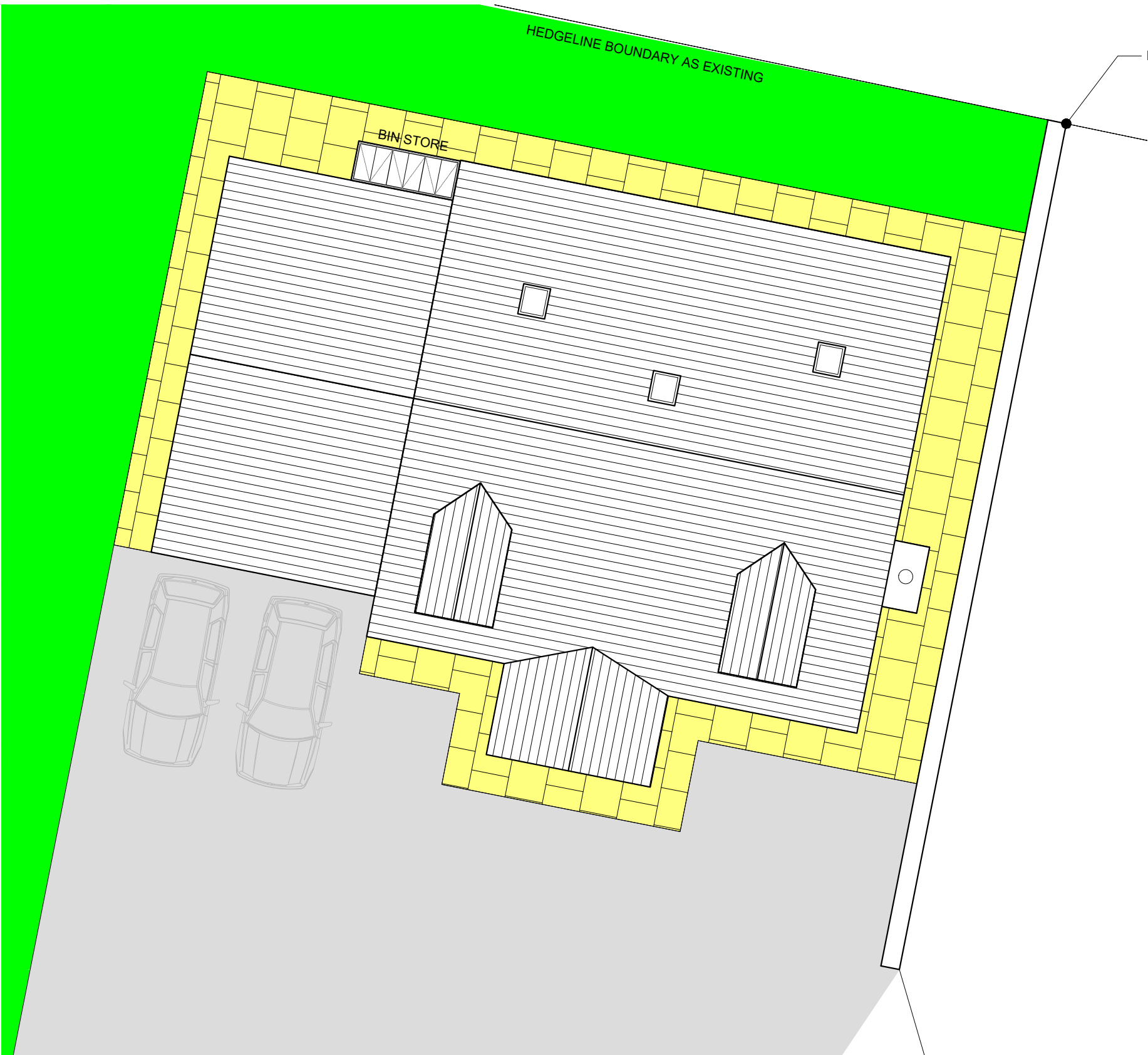
PROPOSED PLAN SCALE 1:200