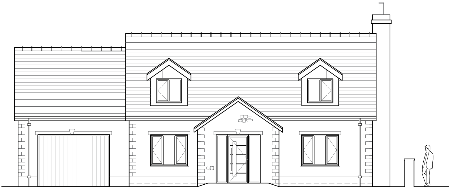
PROPOSED SOUTH WEST ELEVATION SCALE 1:200

500mm wide throated flat top sawn stone copings bedded over to slight fall - 5mm max intermediate joints.