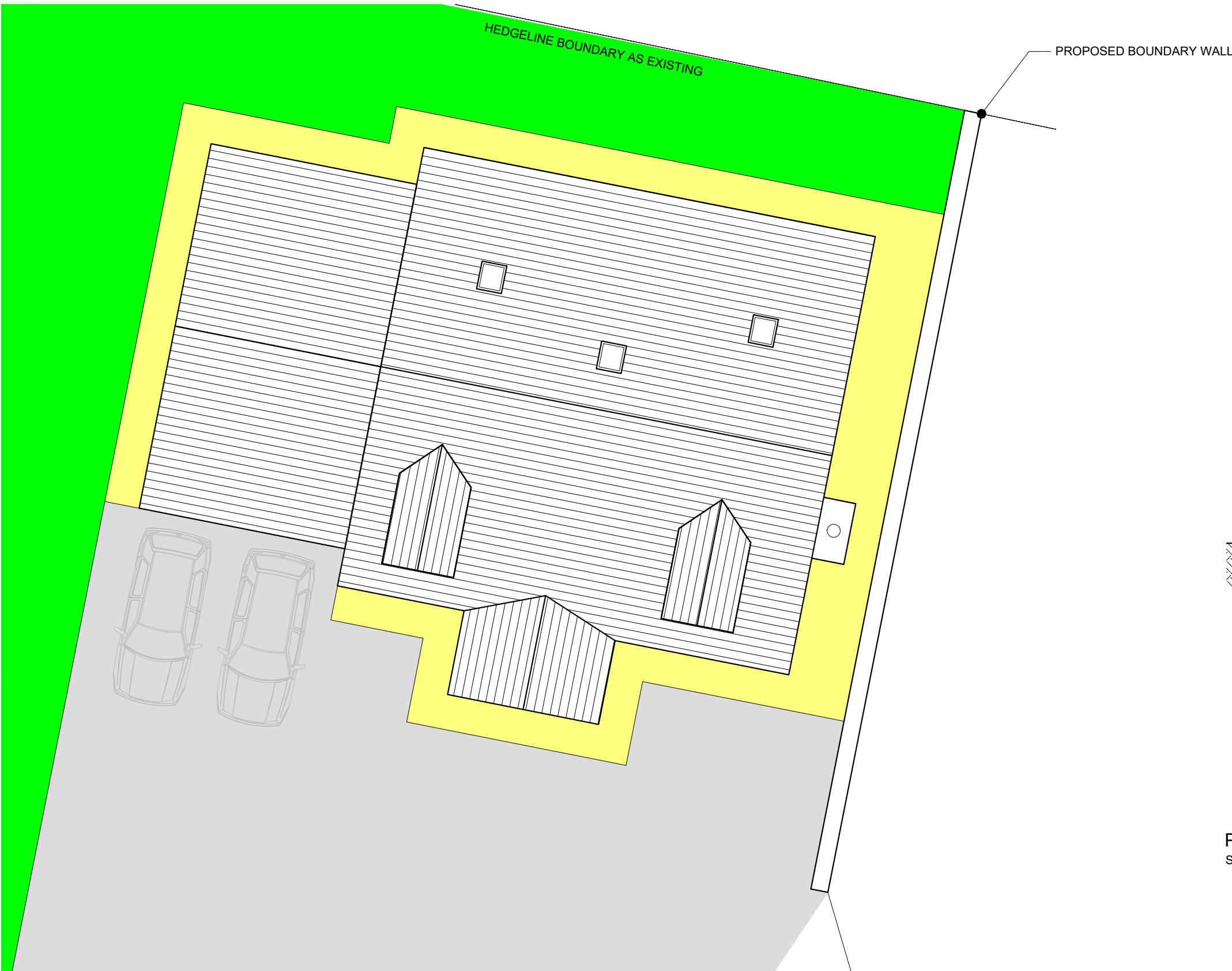
PROPOSED PLAN SCALE 1:200