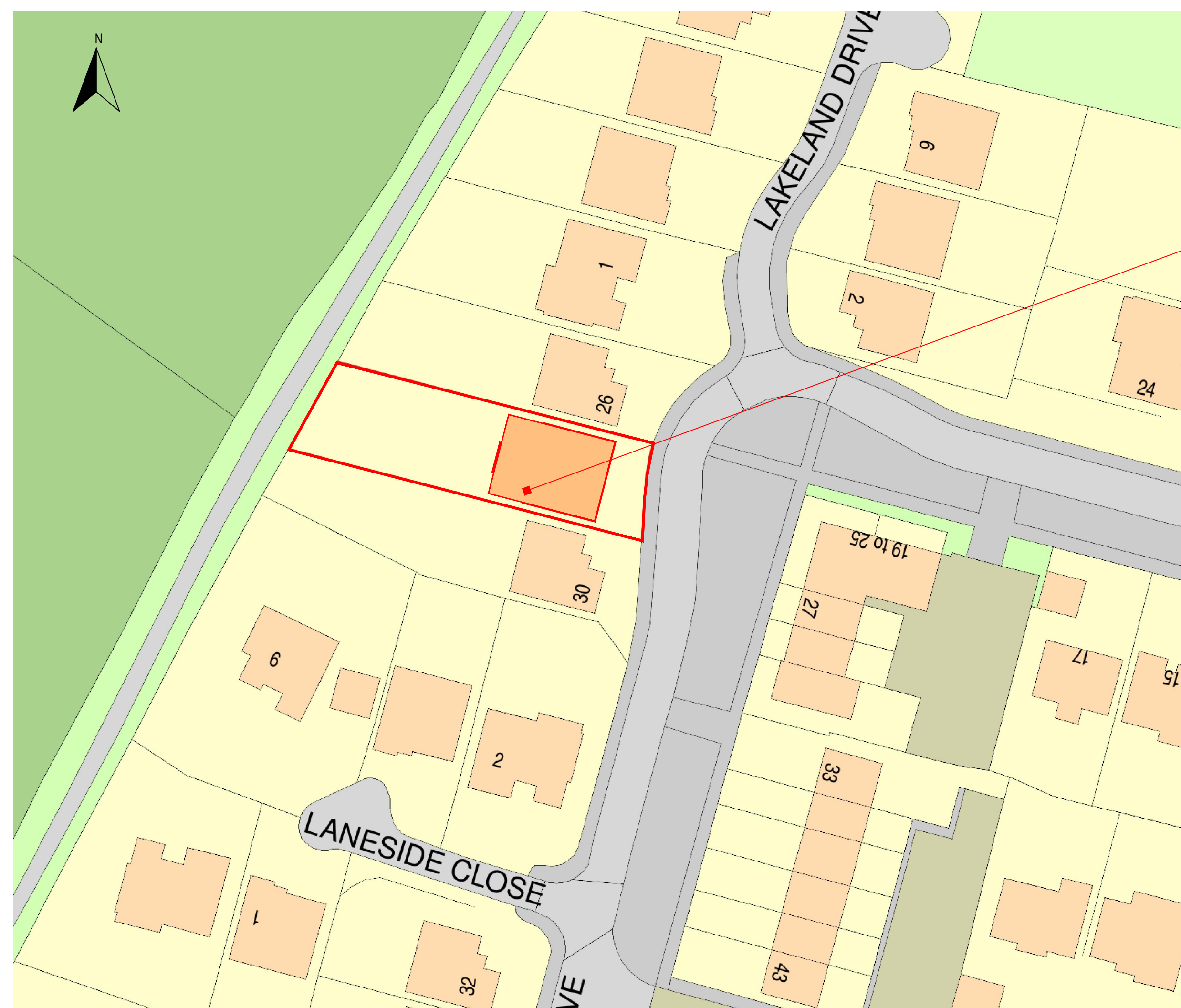
PROPOSED SITE PLAN Scale 1:500