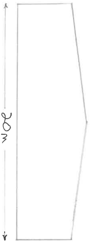
NE + SW ELEVATION

B & J HOUGH & SONS HALL BARN FARM STONYHURST N. CLITHEROE LANCS BB7 9PT