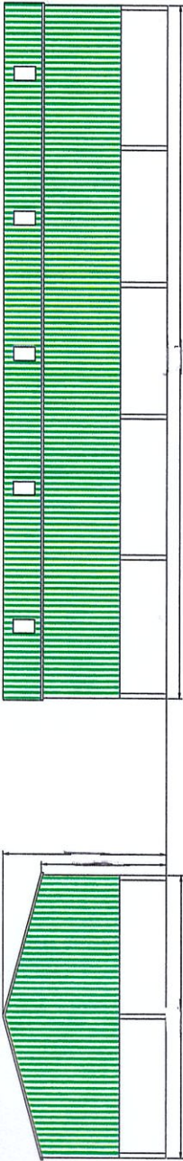
PROPOSED NORTH FACING ELEVATION

MATERIALS: ROOF AND UPPER WALLS IN CONCRETE LOWER WALLS CONCRETE PANELS