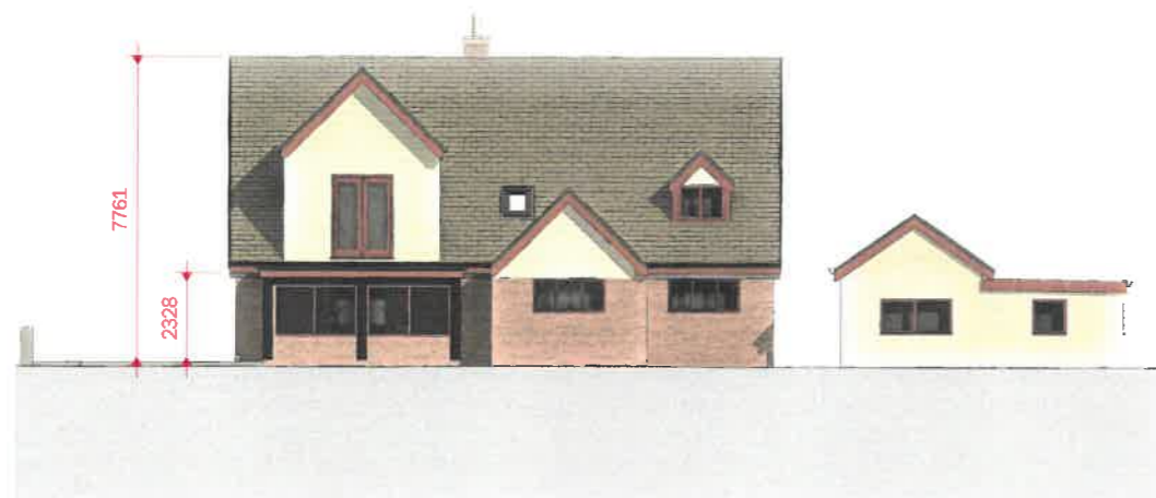
3 EXISTING SOUTH EAST 1 : 100