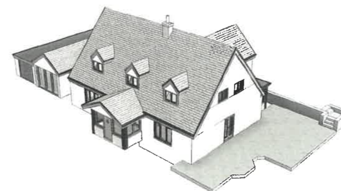
6 WEST AXON