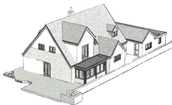
5 SOUTH AXON