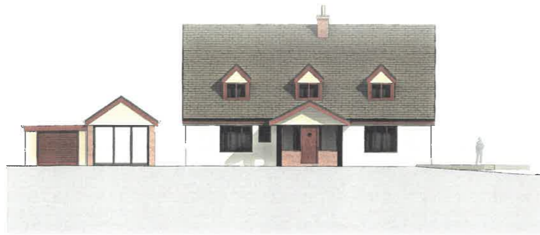
1 EXISTING NORTH WEST 1 : 100