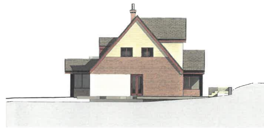
2 EXISTING SOUTH WEST 1 : 100