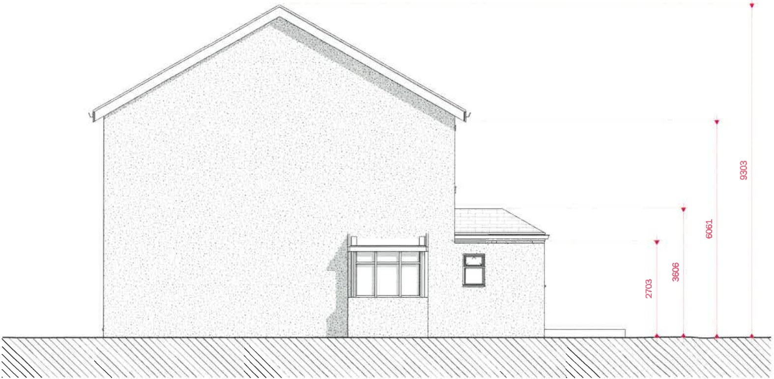
3 EXISTING SOUTH 1 : 50