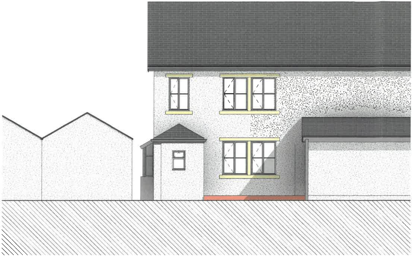
2 EXISTING EAST 1 : 50