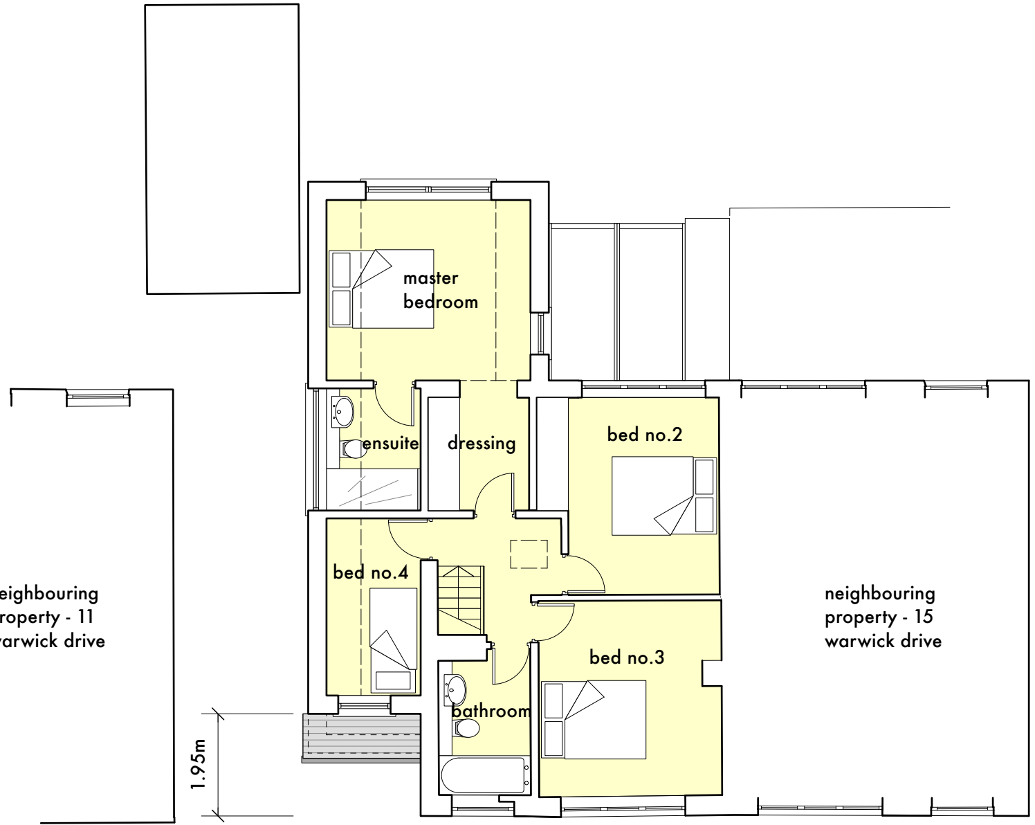
2 First Floor Plan Scale: 1:100