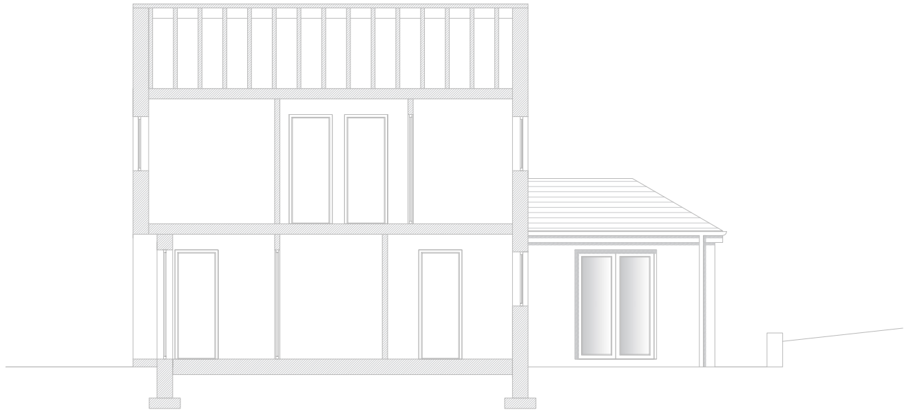
SECTION THROUGH EXISTING