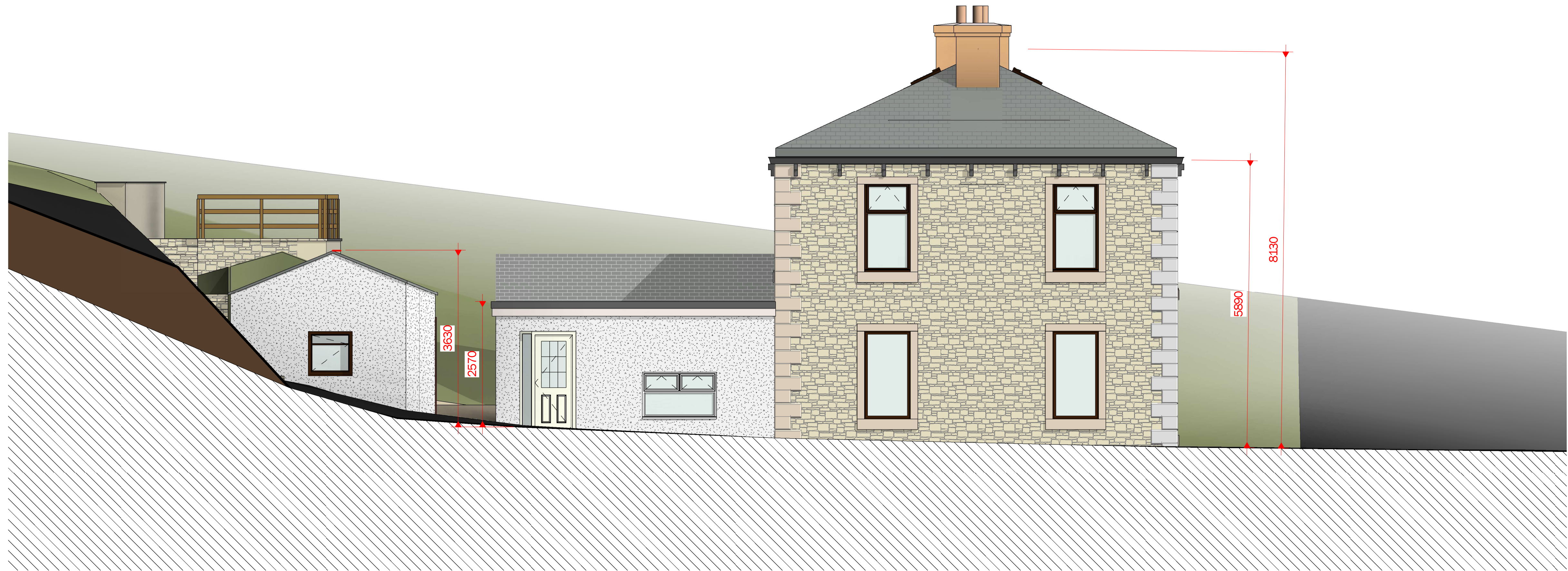
5 EXISTING EAST 1 : 50