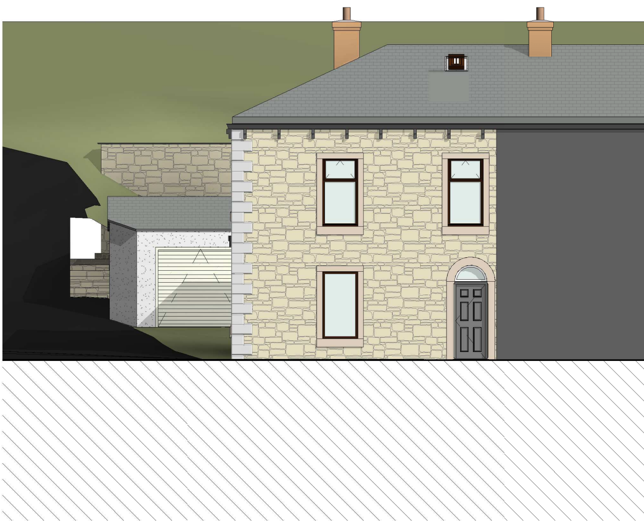
1 EXISTING NORTH 1 : 100