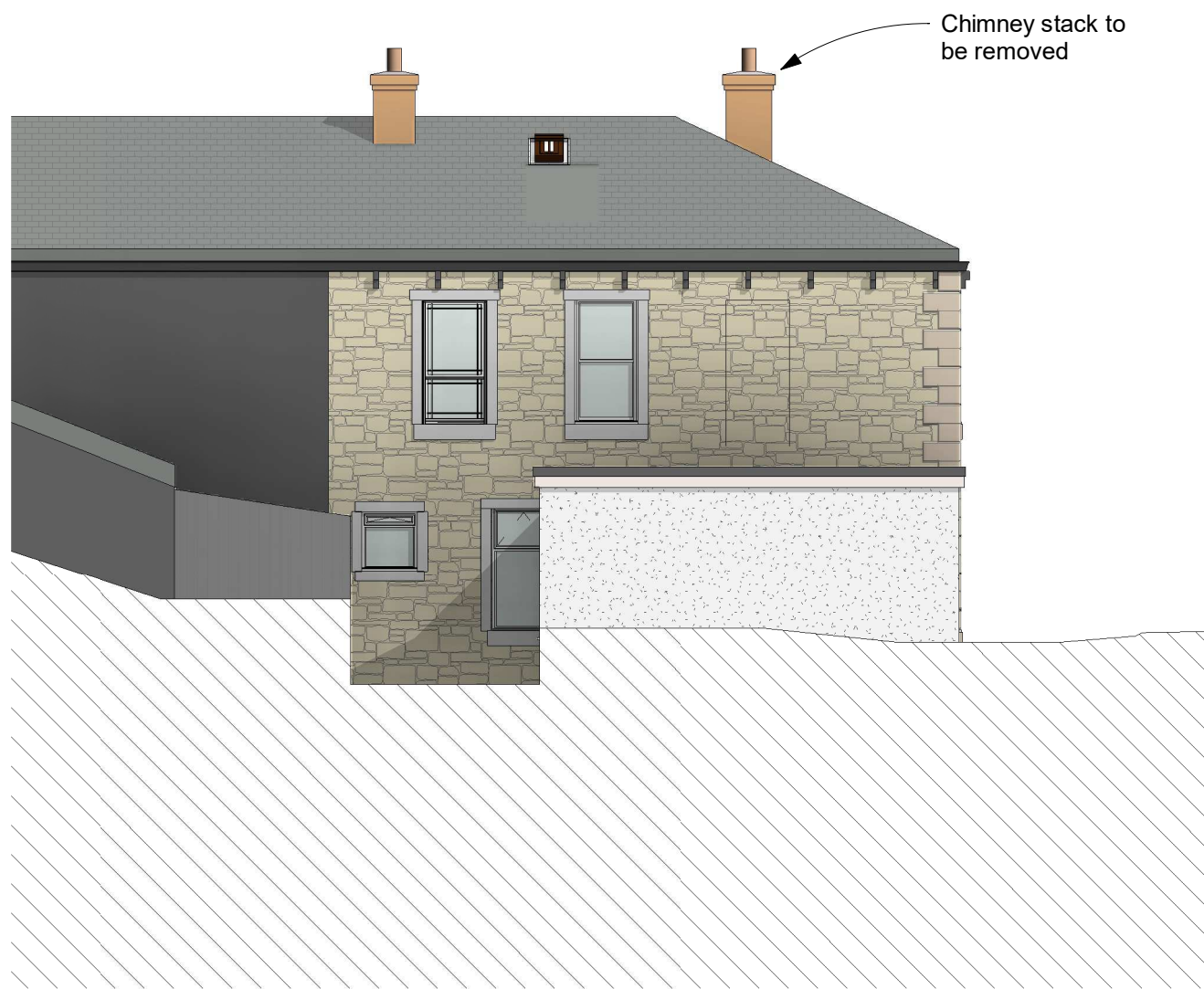
2 EXISTING SOUTH 1 : 100