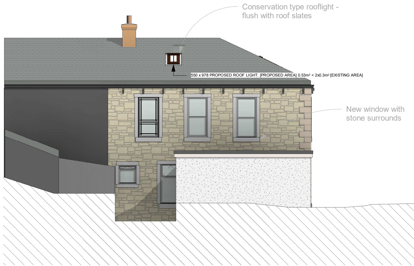
2 PROPOSED SOUTH 1 : 100