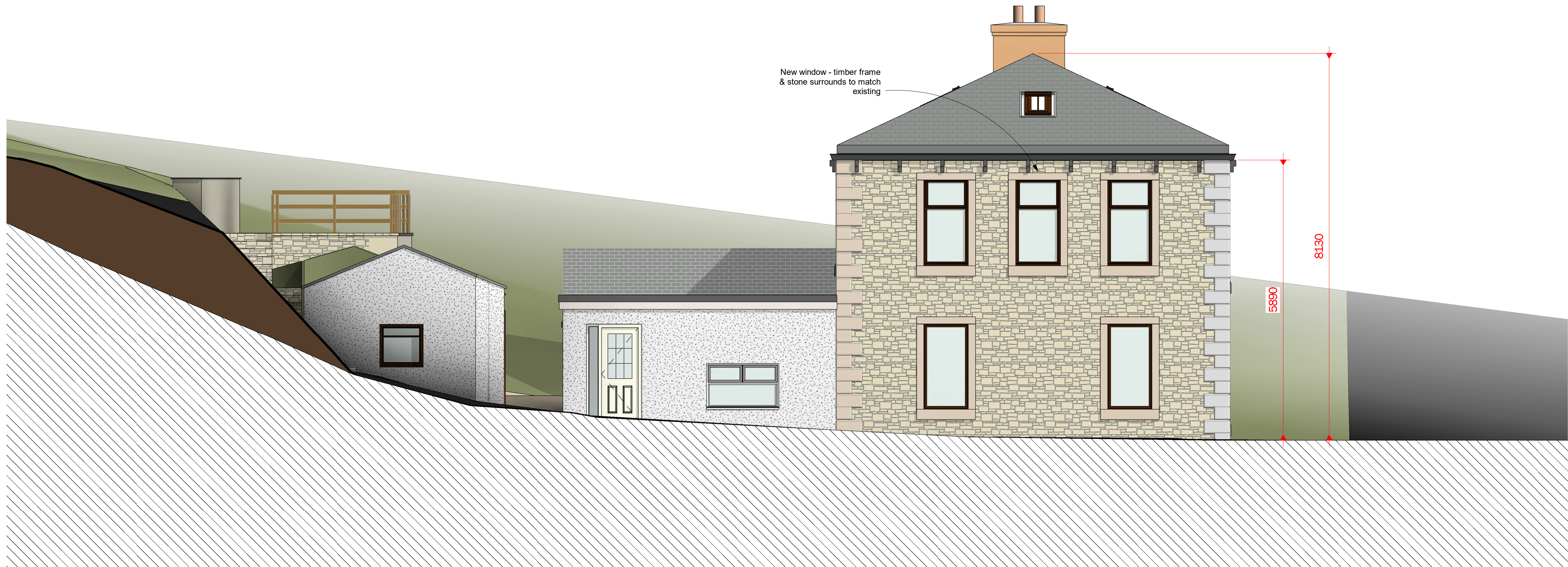
4 PROPOSED EAST 1 : 50