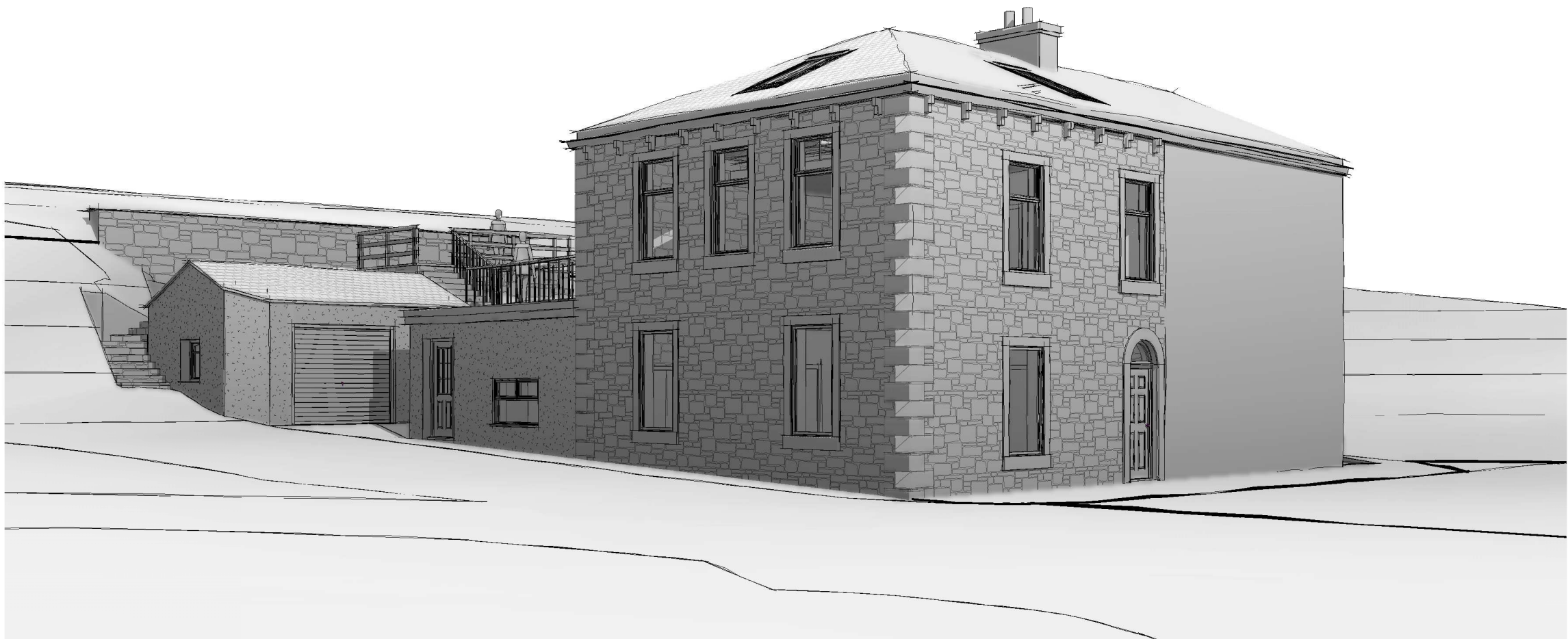
4 WHALLEY RD VIEW