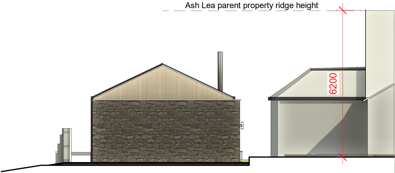
2 PROPOSED East 1 : 100