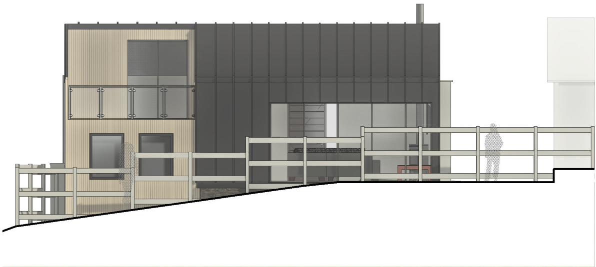
3 PROPOSED South 1 : 100