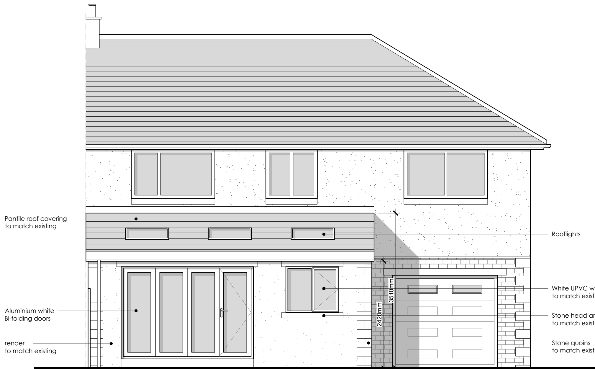
PROPOSED NORTH ELEVATION Scale 1:50