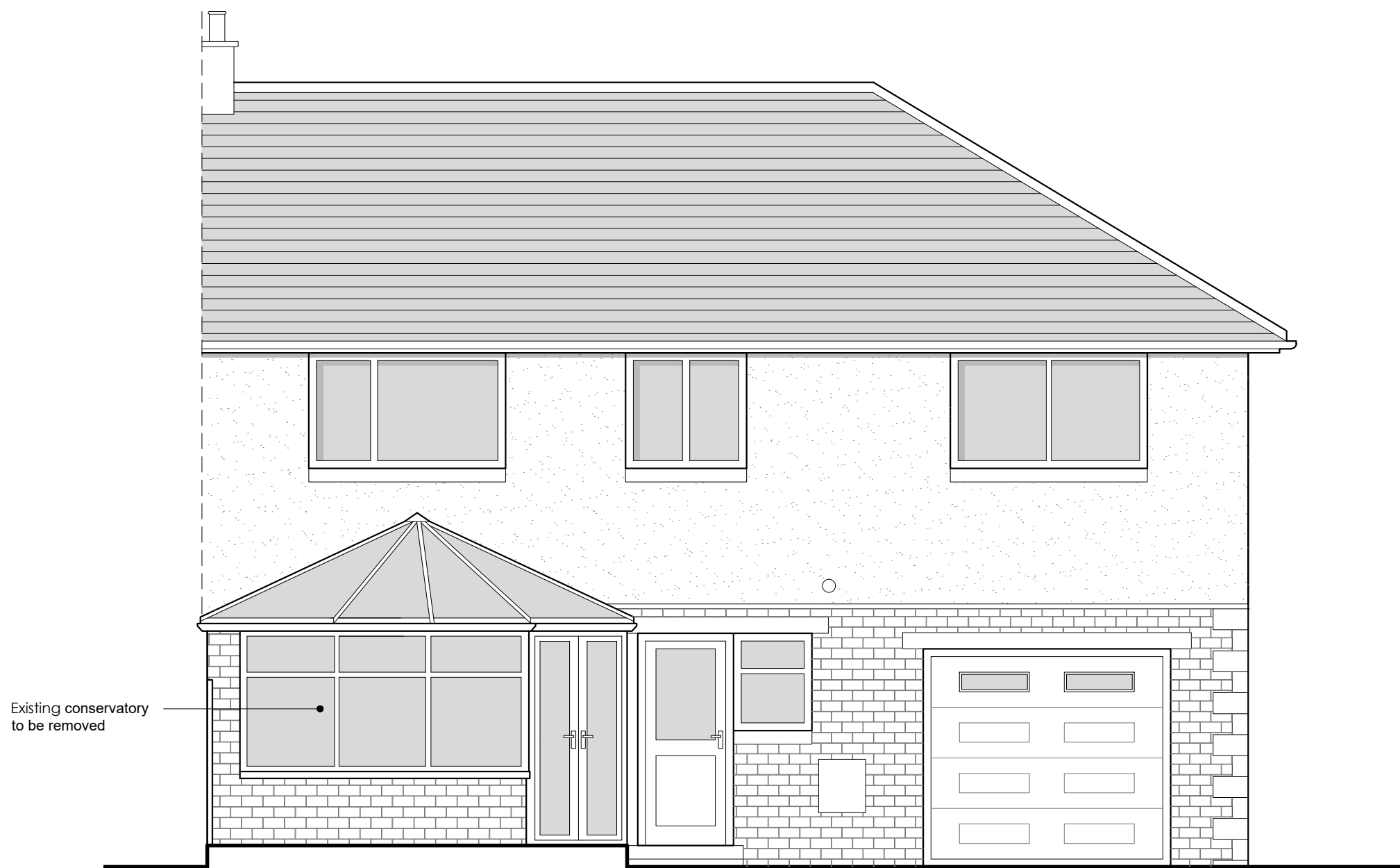
EXISTING NORTH ELEVATION Scale 1:50