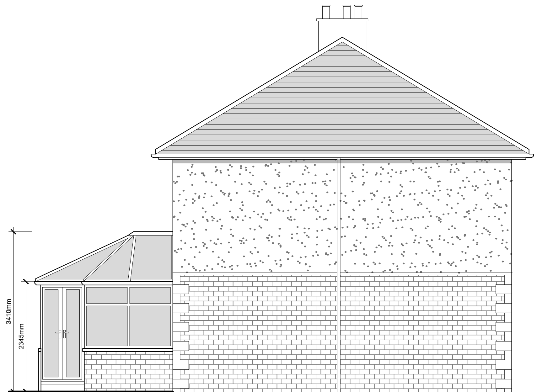
EXISTING WEST ELEVATION Scale 1:50