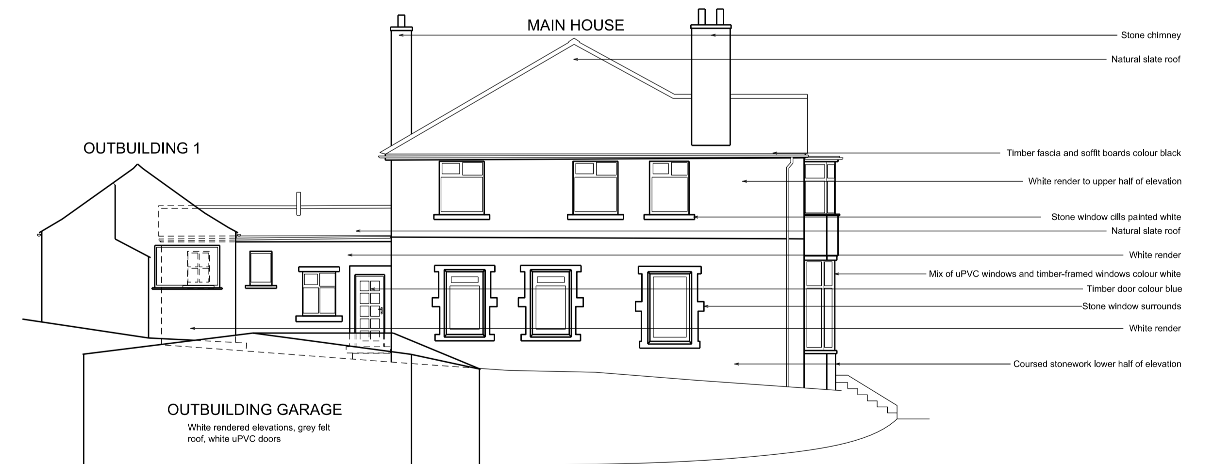
Existing Side Elevation (North-East) Scale 1:100