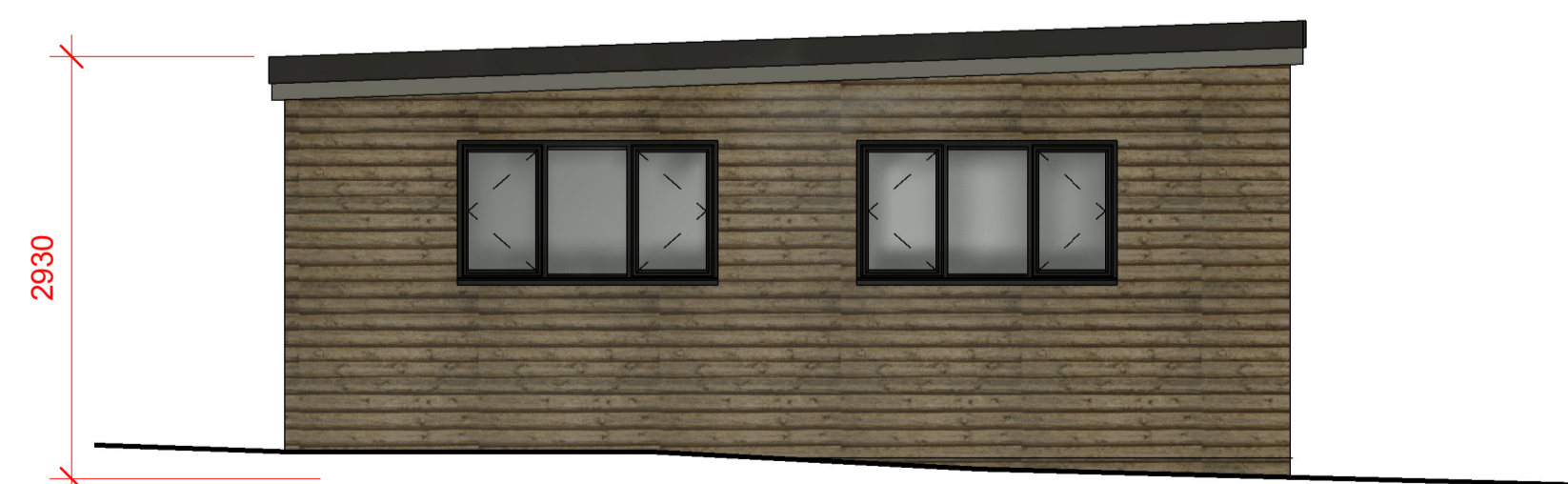
4 Store West Elevation 1 : 50