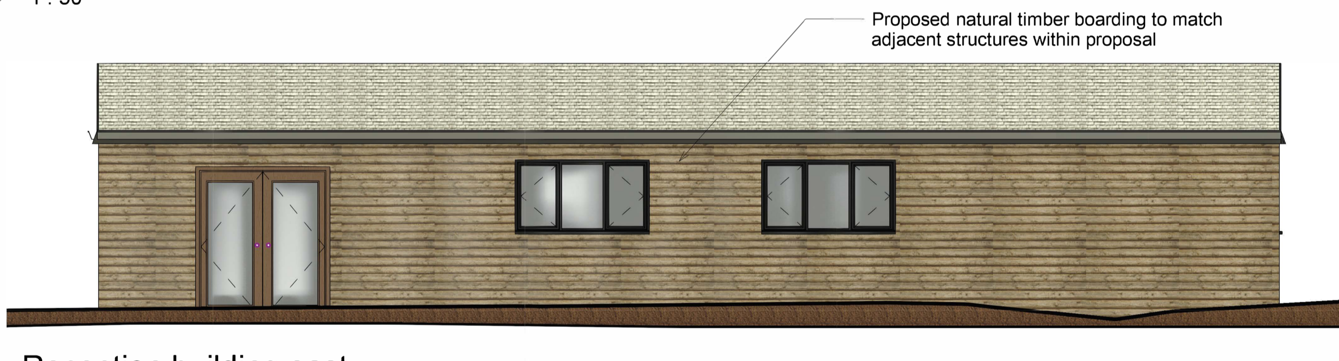
3 Reception building east 1 : 50