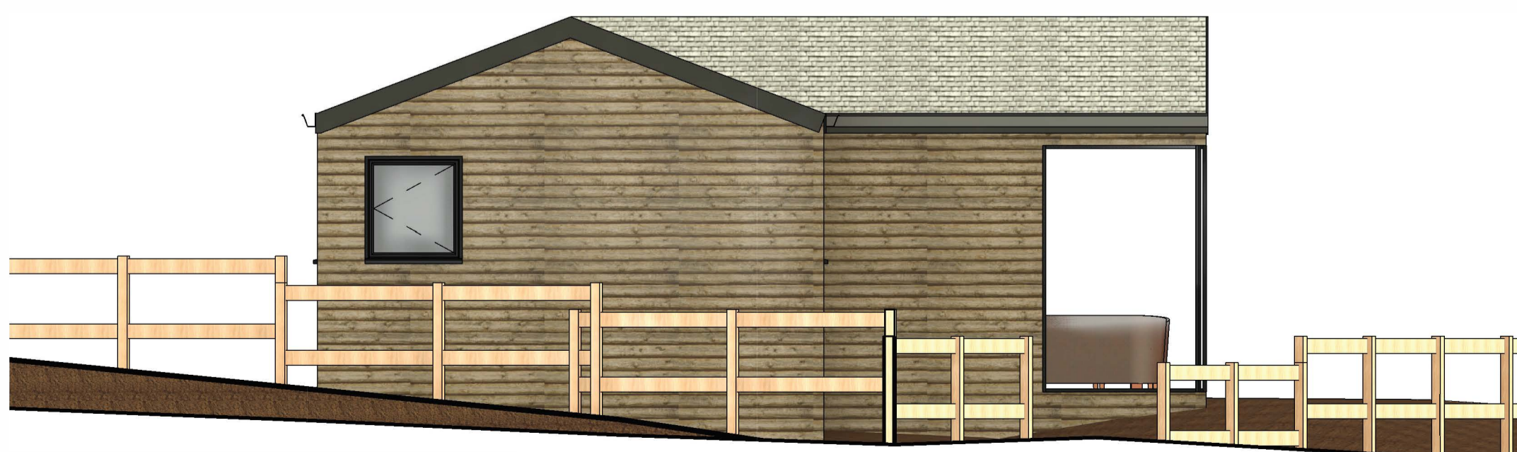
4 Reception building north 1 : 50