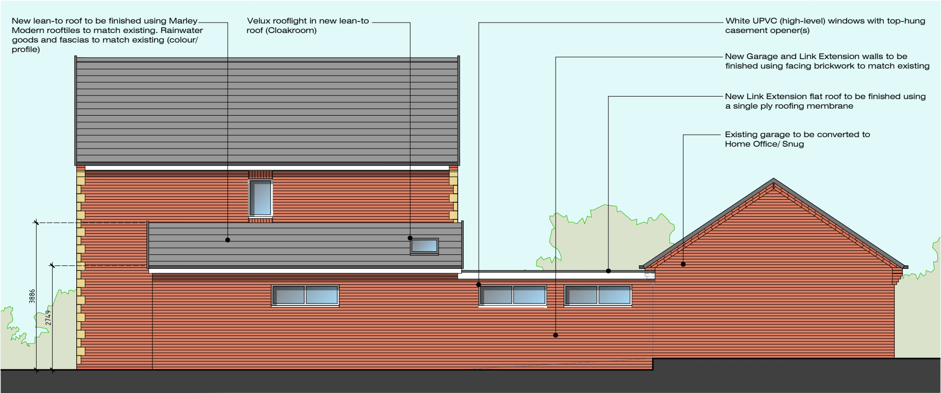
Rear (North) Elevation