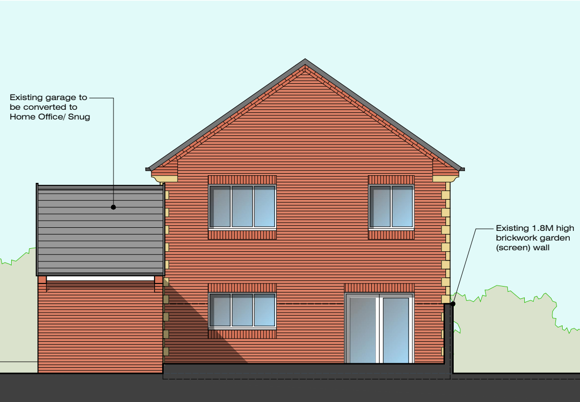
Side (West) Elevation