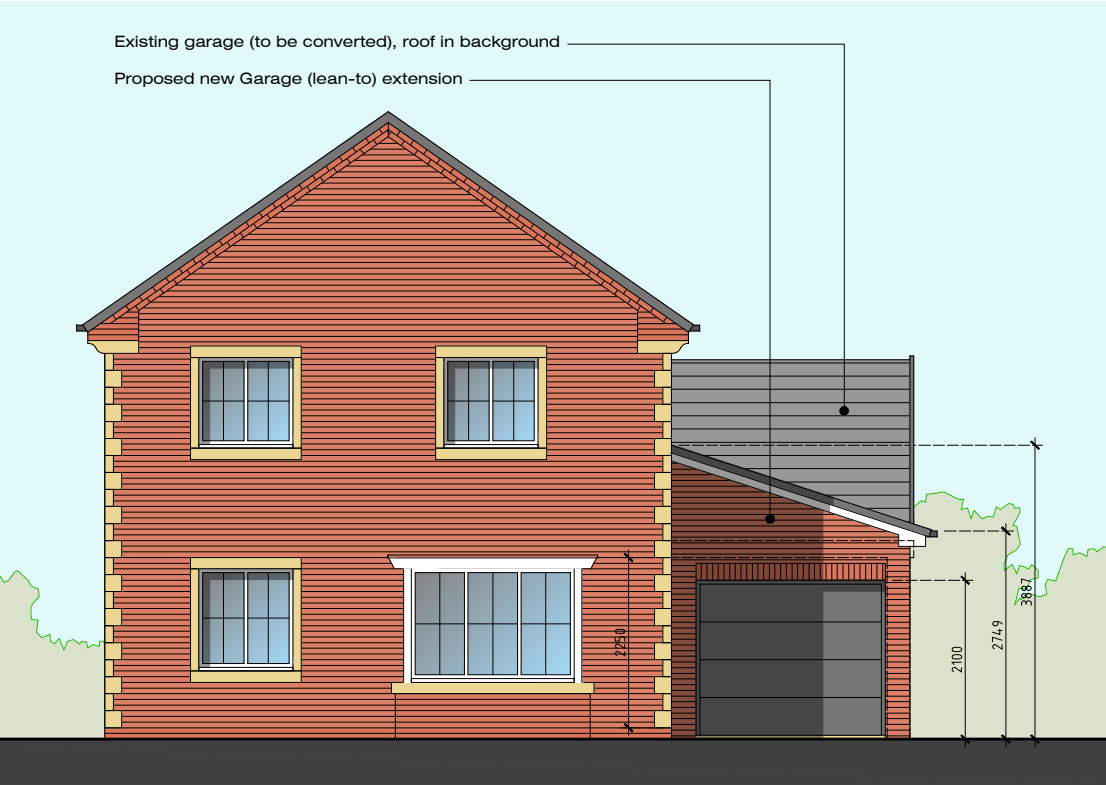
Side (East) Elevation

2 WATER MEADOWS - LONGRIDGE - PRESTON - PR3 3BW