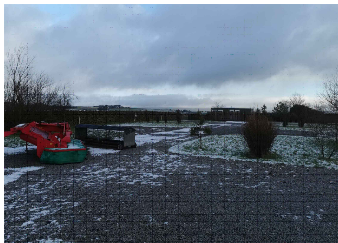
VIEW D OF EXISTING CARAVAN PITCHES