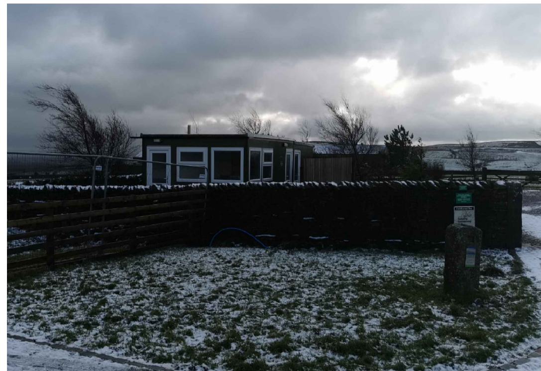
VIEW A OF EXISTING SHOWER / TOILET FACILITIES TO BE RELOCATED FROM NORTH