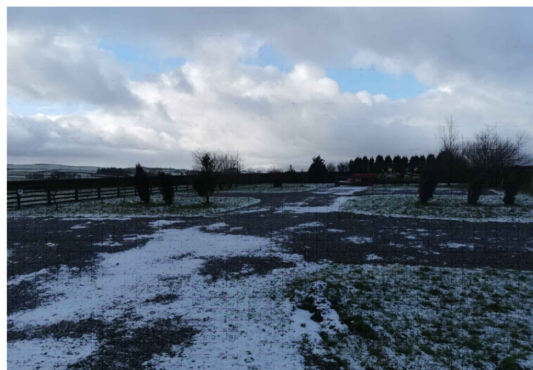
VIEW C OF EXISTING CARAVAN PITCHES