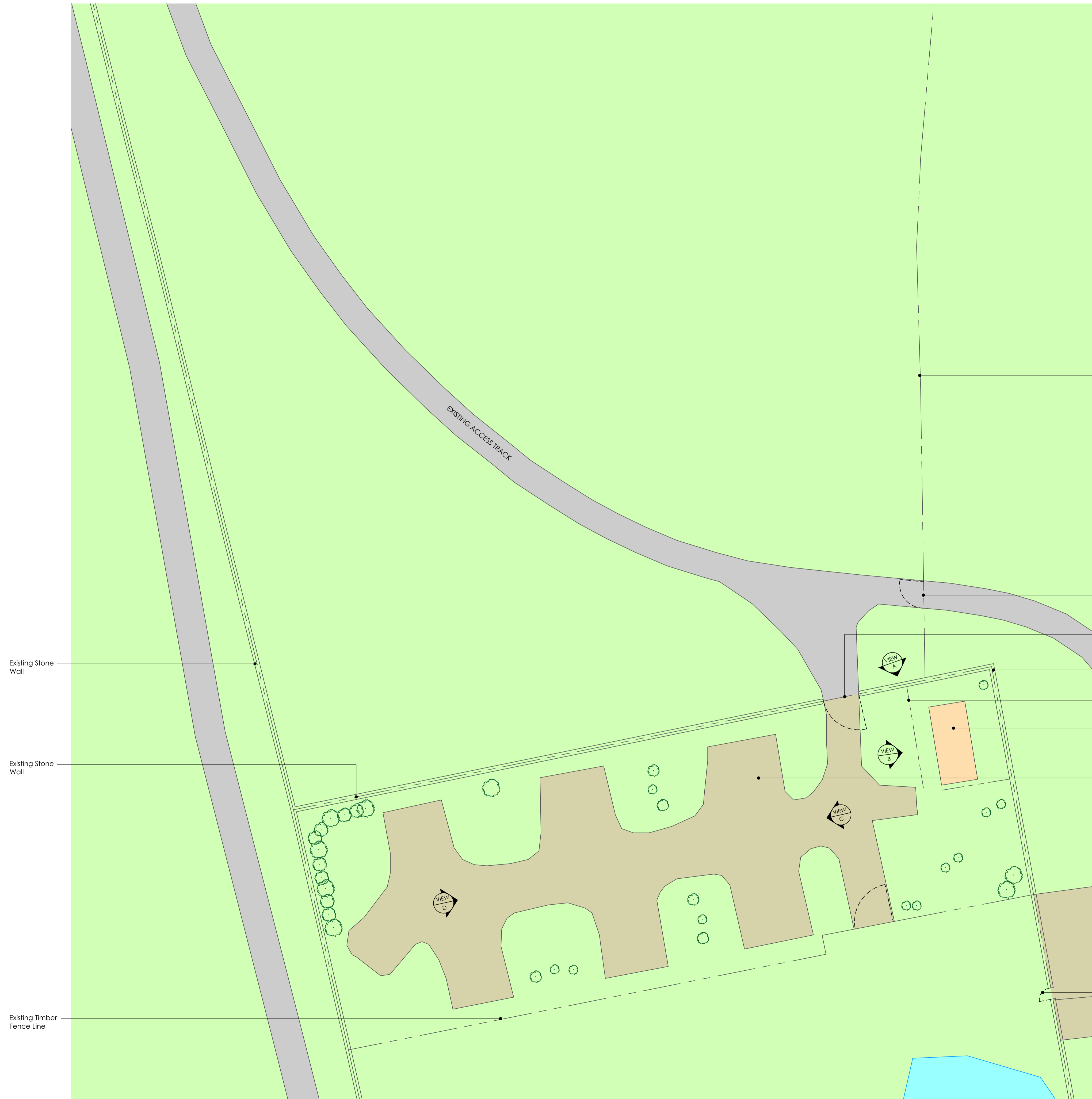
EXISTING SITE PLAN Scale 1:200