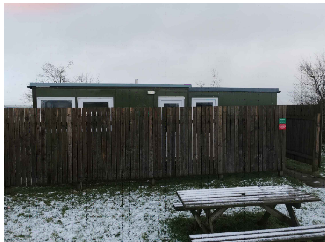
VIEW B OF EXISTING SHOWER / TOILET FACILITIES TO BE RELOCATED FROM WEST